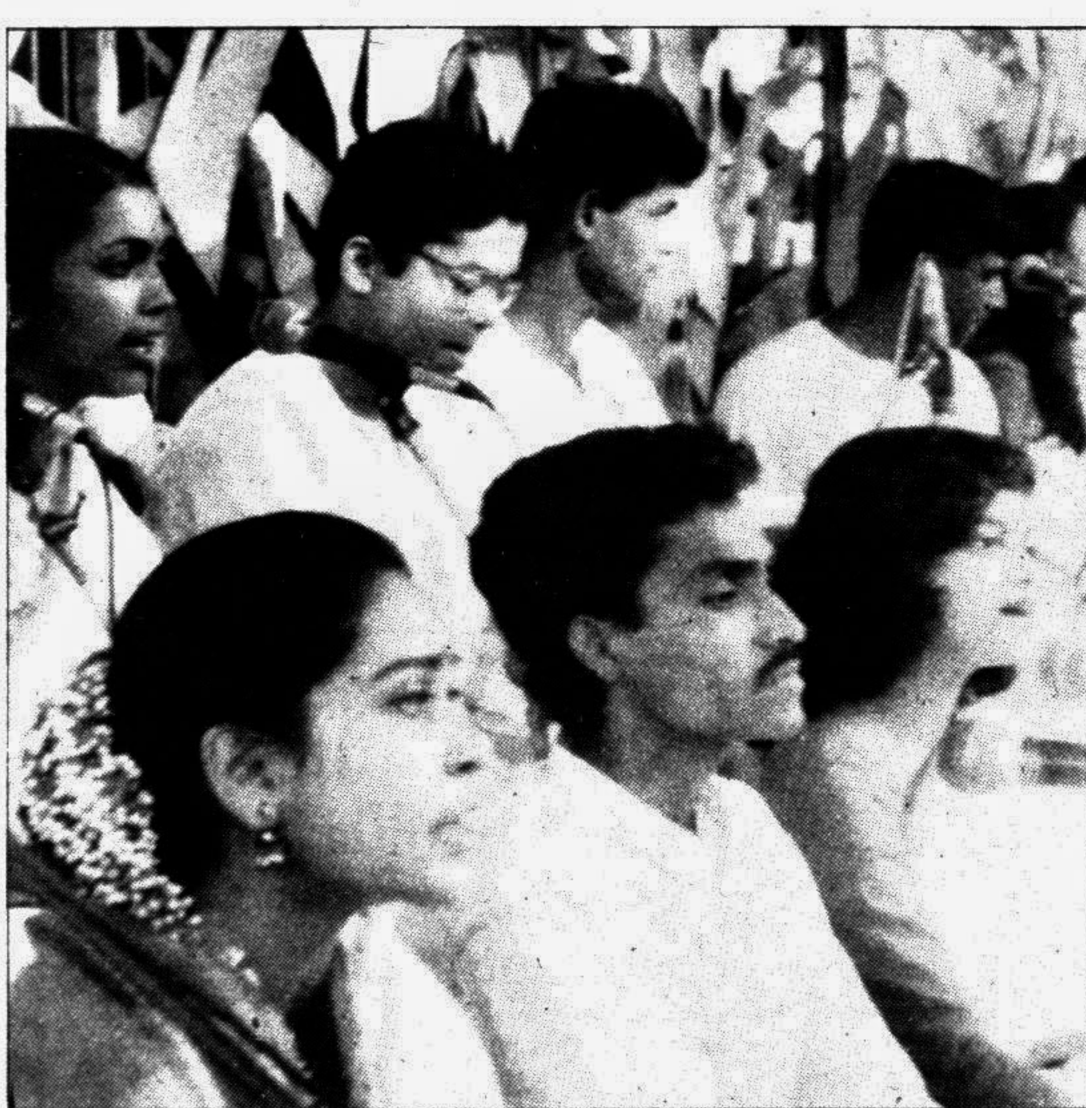
Singers welcoming the Bengali season of Sharat (autumn) at a function organised at the Charukala Institute in the city yesterday.