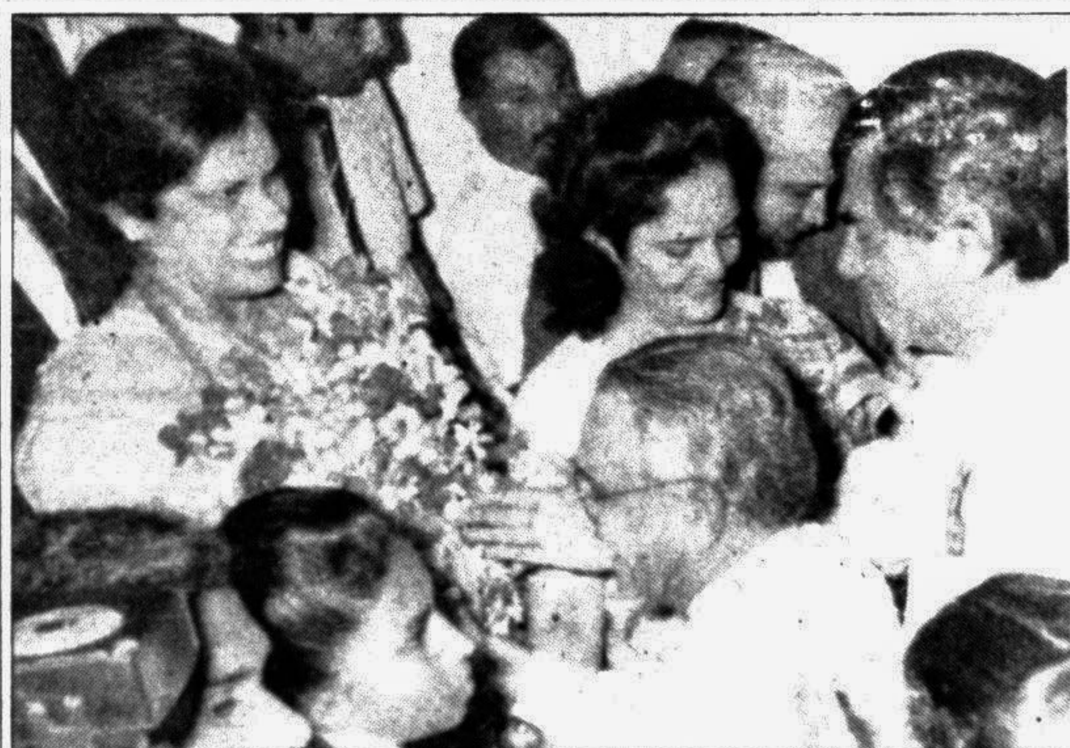
Sri Lankan Prime Minister Chandrika Kumaratunga (L, wearing garlands) is greeted by ministers of her cabinet yesterday shortly after she filed her nomination papers in Colombo to kick off the race for next month's presidential polls.

Star Report The proposals for setting up seven more banks in the private sector will be placed before the cabinet shortly for its consideration, according to sources concerned. The cabinet committee on finance and economic affairs has selected seven out of nine applications seeking permission to set up banks. The cabinet will now take a decision on the matter, the sources said. As regards the two other proposed banks, the cabinet committee suggested some changes in their character and structure. The two are the Northern Bank and the BRAC Bank. The cabinet committee said since the BRAC Bank's sponsor is an NGO (Bangladesh Rural Advancement Committee) and its target group is the rural poor, the sponsor should seek permission to operate it as a specialised bank and not a commercial one. The sponsor should, therefore, apply for registration of the bank, not under the Banking Companies Act but under a 'special arrangement', sources quoted the committee as saying. In this regard, the committee referred to the Grameen Bank which was given permission to operate under a special ordinance. The seven banks which got favourable recommendation are: the Prime Bank Ltd, sponsored by M A Khaleq, R A Gani and Lutfar Rahman Sarker; the Bangladesh Social Investment Bank, sponsored by Dr M A Mannan, Islamic Solidarity Fund, Muslim World League and World Assembly of Muslim Youth; the Al Arafat Bank, sponsored by A Z M Shamsul Islam, Ahmed Fazlur Rahman and Mohammad Rezauddin; See Page 12 Col 3