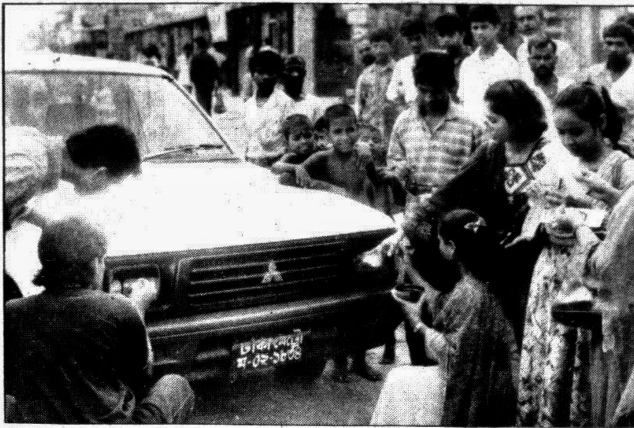
Members of the Lions Club District 315 in a drive to shade car headlights in the city yesterday. They are seen using black paint to shade one thirds of the headlights of a car which is mandatory under traffic rule.

There were twelve oil on canvas works in the exhibition. It is a pity that only one got sold. Yet, this is understandable, going by the present situation in Bangladesh.