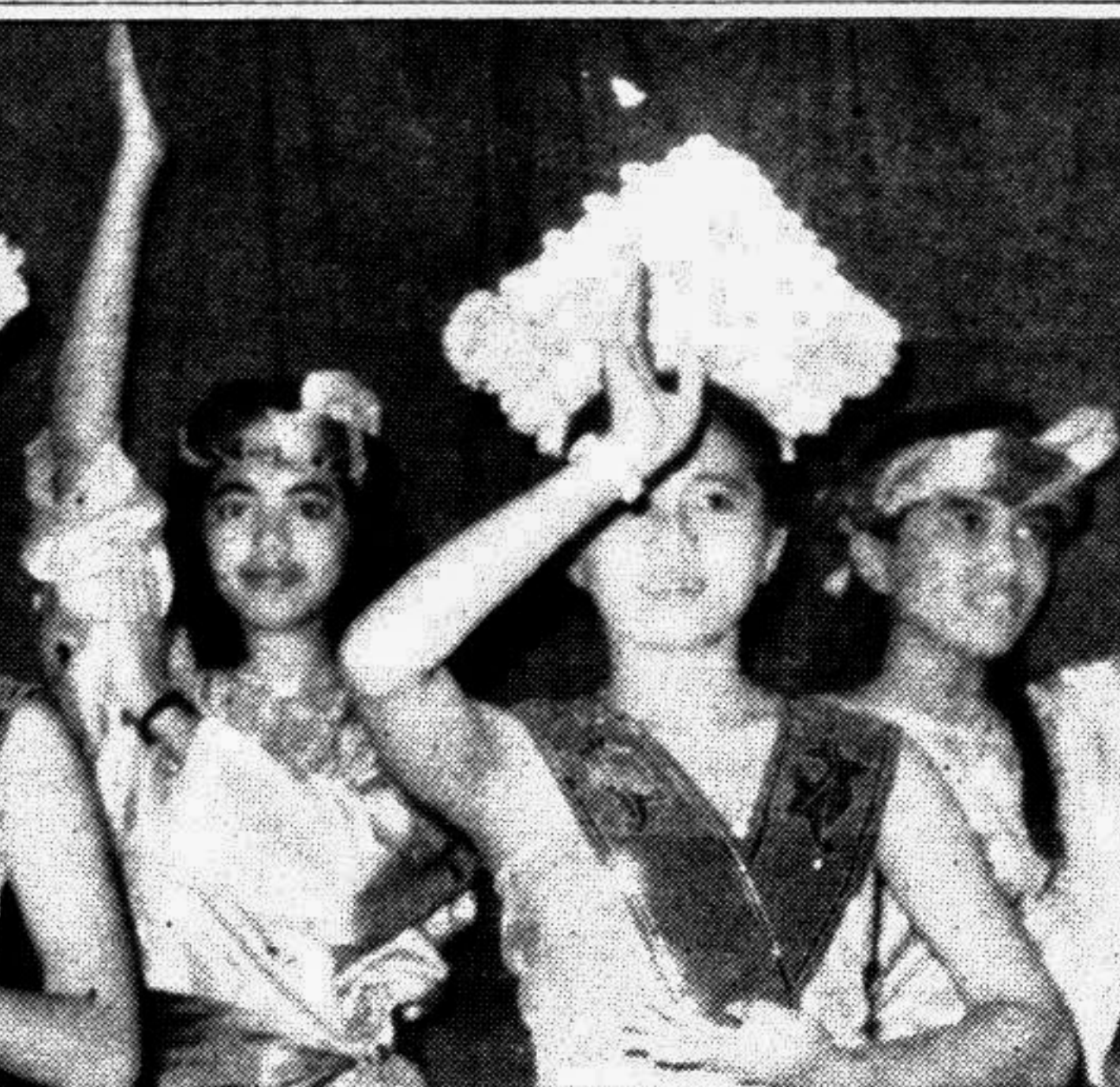
Indonesian child artists and members of the juvenile organisation Kachi Kachar Mela, presenting a dance at the Shilpakala Academy auditorium in the city on the occasion of the organisation's 38th founding anniversary yesterday.