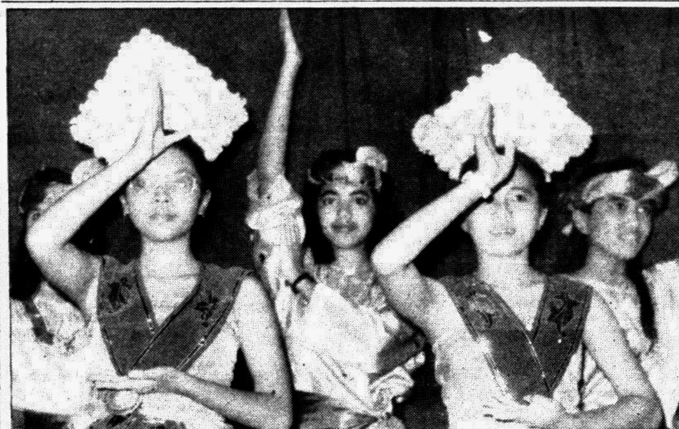
Indonesian child artists and members of the juvenile organisation Kachi Kachar Mela, presenting a dance at the Shilpakala Academy auditorium in the city on the occasion of the organisation's 38th founding anniversary yesterday.

Met office sources said that in 1992 the monsoon rainfall was 30 per cent below the normal. In 1979 also, a failed monsoon was recorded.