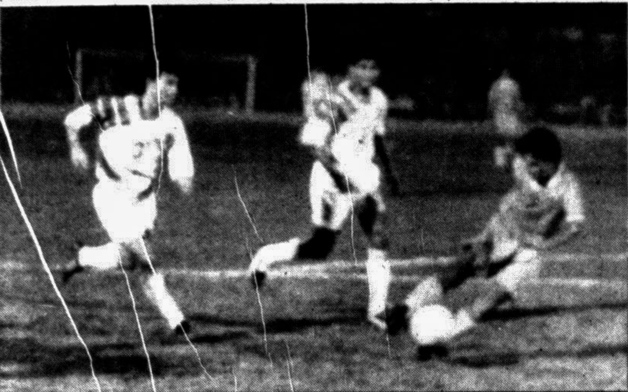
Action from last night's crucial Star Premier Division football league encounter between Mukti-joddha Sangsad Krira Chakra and Brothers Union at the Dhaka Stadium. The game ended 2-2.

Appalling defensive errors made star-studded Mukti-joddha Sangsad Krira Chakra mull twin opportunities of a revenge and a booster to their maiden title quest as they settled for a two-all draw with Brothers Union in a crucial Star Premier league match at the Dhaka Stadium yesterday. The sharing of points between the two major names after popular heavyweights Mohammedans and Abahani leave the latter minus another deterrent in their long drawn-out campaign for regaining the title. Abahani, who are now all set to win the mantle back from arch-rivals Mohammedans, continue to reign at the top of the points table with 22 points from 13 matches, three more than Mukti-joddha, who, following yesterday's draw, languish at the second position with 19 points from 13 matches.