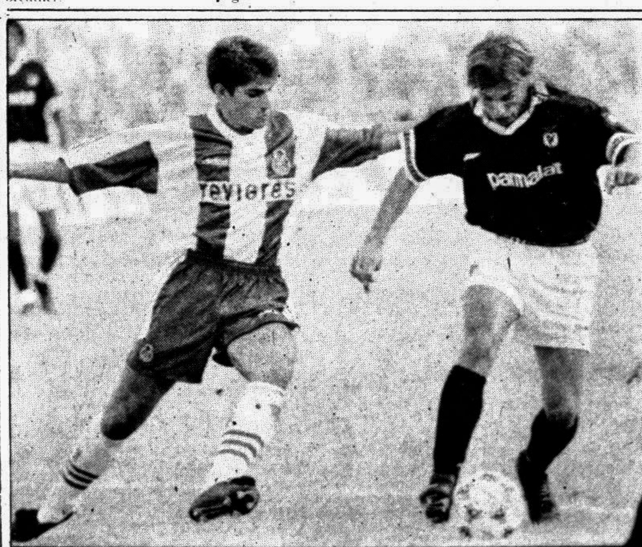
Benfica's Argentine star Claudio Caniggia (R) tries to weave through a tackle by FC Porto's Paulinho Santos during their Portuguese league encounter on Oct 2. The game ended 1-1.