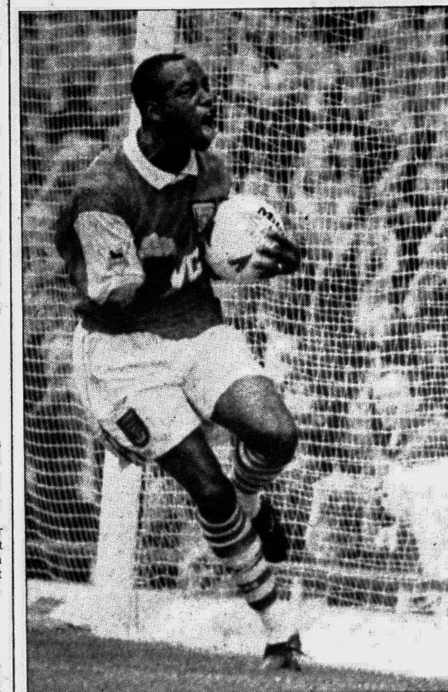
Striker Ian Wright exults after scoring his 100th goal for Arsenal against Crystal Palace in the English Premier League in London on Oct 1. However, Palace won 2-1.

Three years to the day after a knee injury almost wrecked his career, John Salako damaged Arsenal's title aspirations with both goals in Crystal Palace's 2-0 win at Highbury.