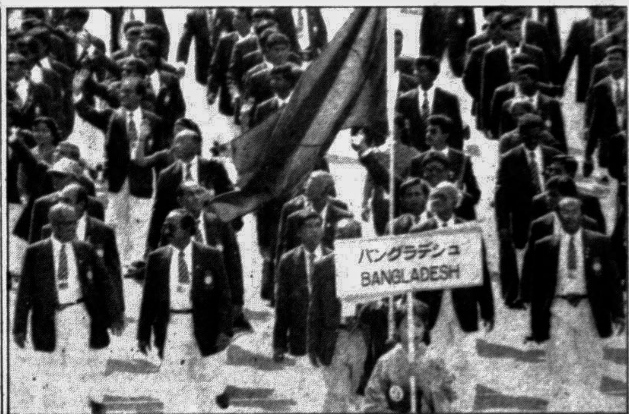
The Bangladesh delegation parade through the stadium during the opening ceremony of the 12th Asian Games in Hiroshima yesterday.