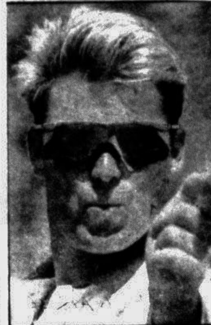
S WARNE ... m-o-m

But Inzamam and Rashid Latif refused to accept that their side's cause was lost.