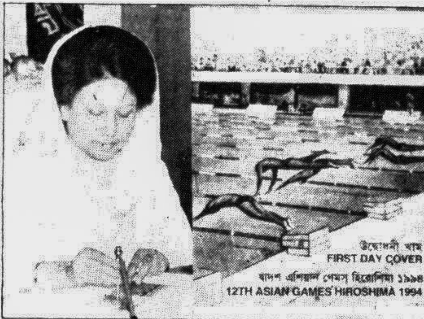
Prime Minister Begum Khaleda Zia releasing the commemorative postage stamp issued by the Bangladesh Post Office on the occasion of 12th Asian Games Hiroshima '94 at her office yesterday. The stamp is seen on the right.