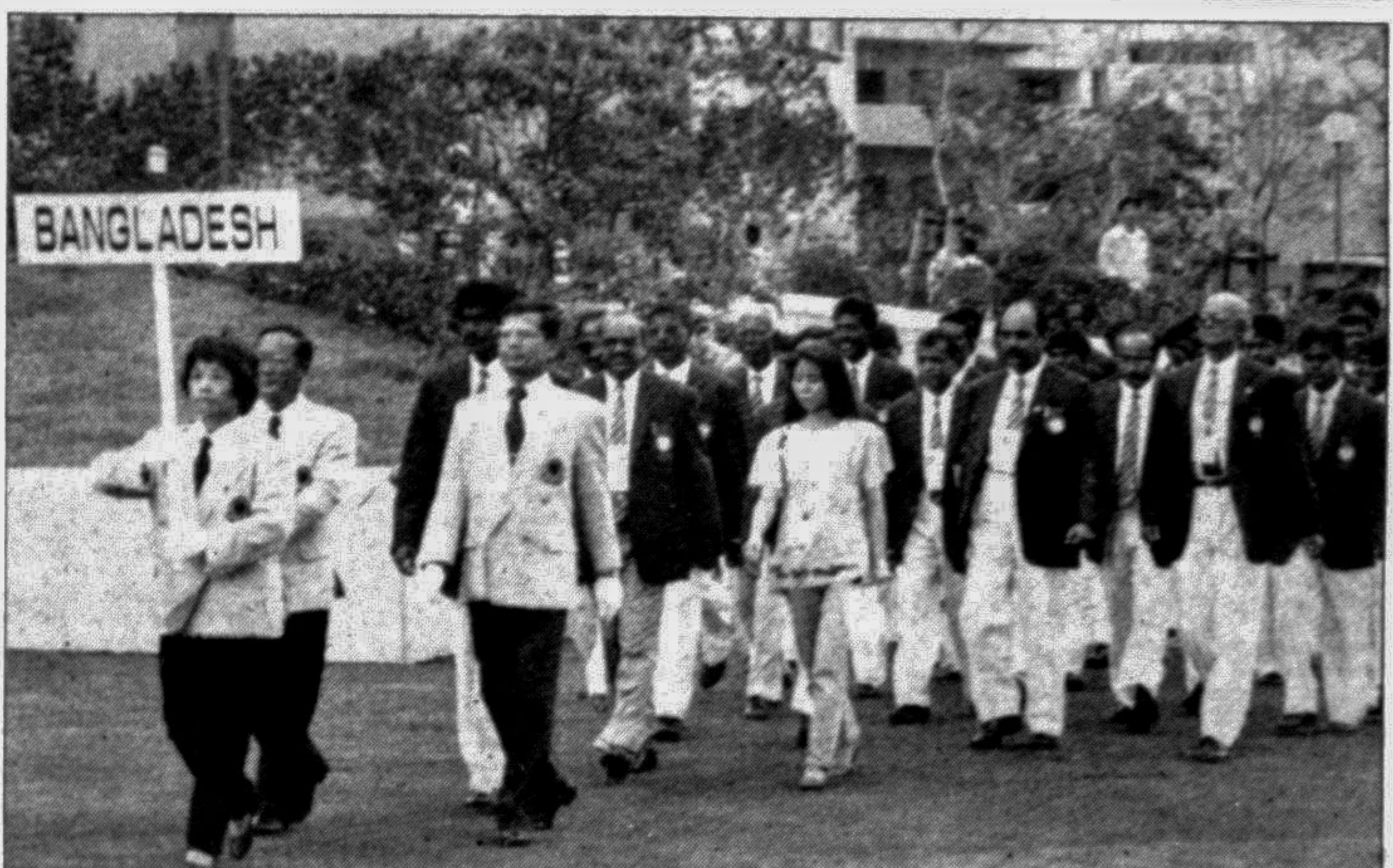
The Bangladeshi contingent for the twelfth Asiad, beginning in Hiroshima today is being led out for the flag-raising ceremony at the Athletes Village yesterday.