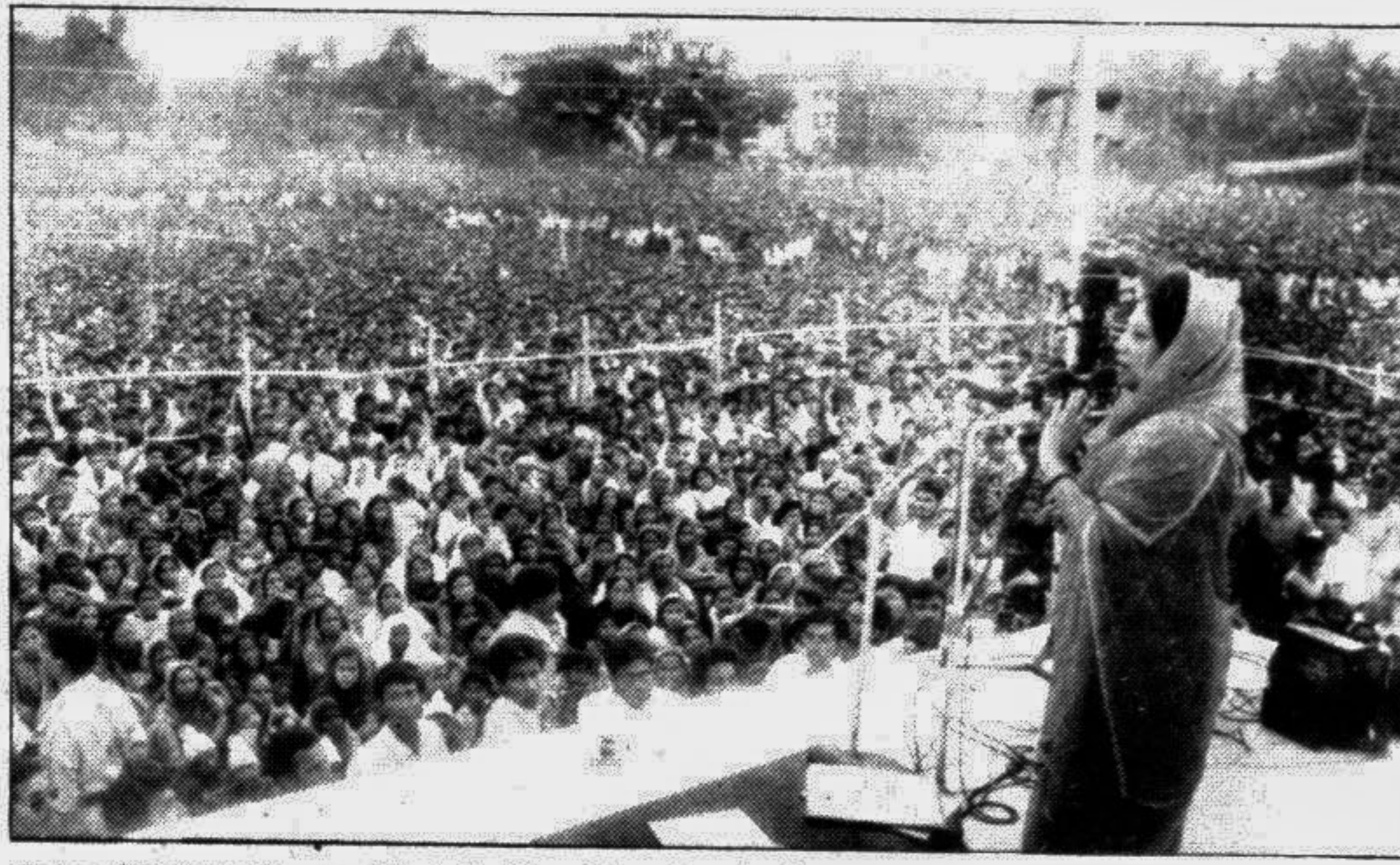
Prime Minister Begum Khaleda Zia addressing the biggest-ever public meeting at the Circuit House ground in Khulna yesterday.

By Staff Correspondent The three mainstream opposition parties — the Awami League, the Jatiya Party and the Jamaat-e-Islami — demanding elections under caretaker government, begin a 40-day agitation programme today. Identical programmes were announced by the leaders of these parties from separate public rallies in the city Thursday. The programmes of the AL and the JP will culminate in the staging of an indefinite sit-in before the Prime Minister's Secretariat on November 9 while the Jamaat supporters will march towards the same venue the same day. Today, all three parties will observe a nationwide 'protest