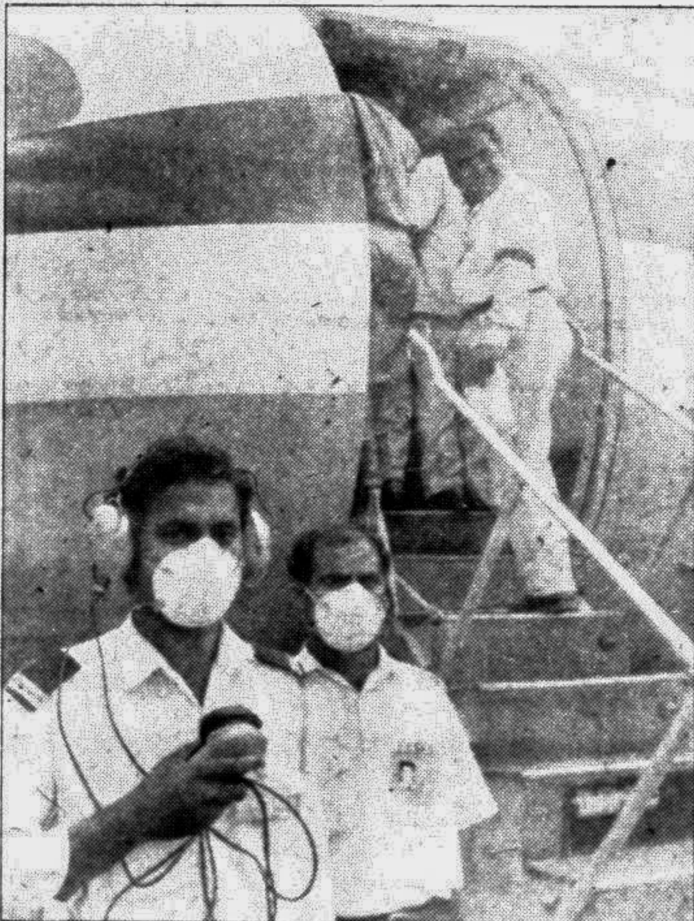
A team of doctors entering a Biman aircraft at the Zia International Airport yesterday as part of government's plague screening programme. Biman ground staff seen wearing face masks while handling passengers arriving from Calcutta.