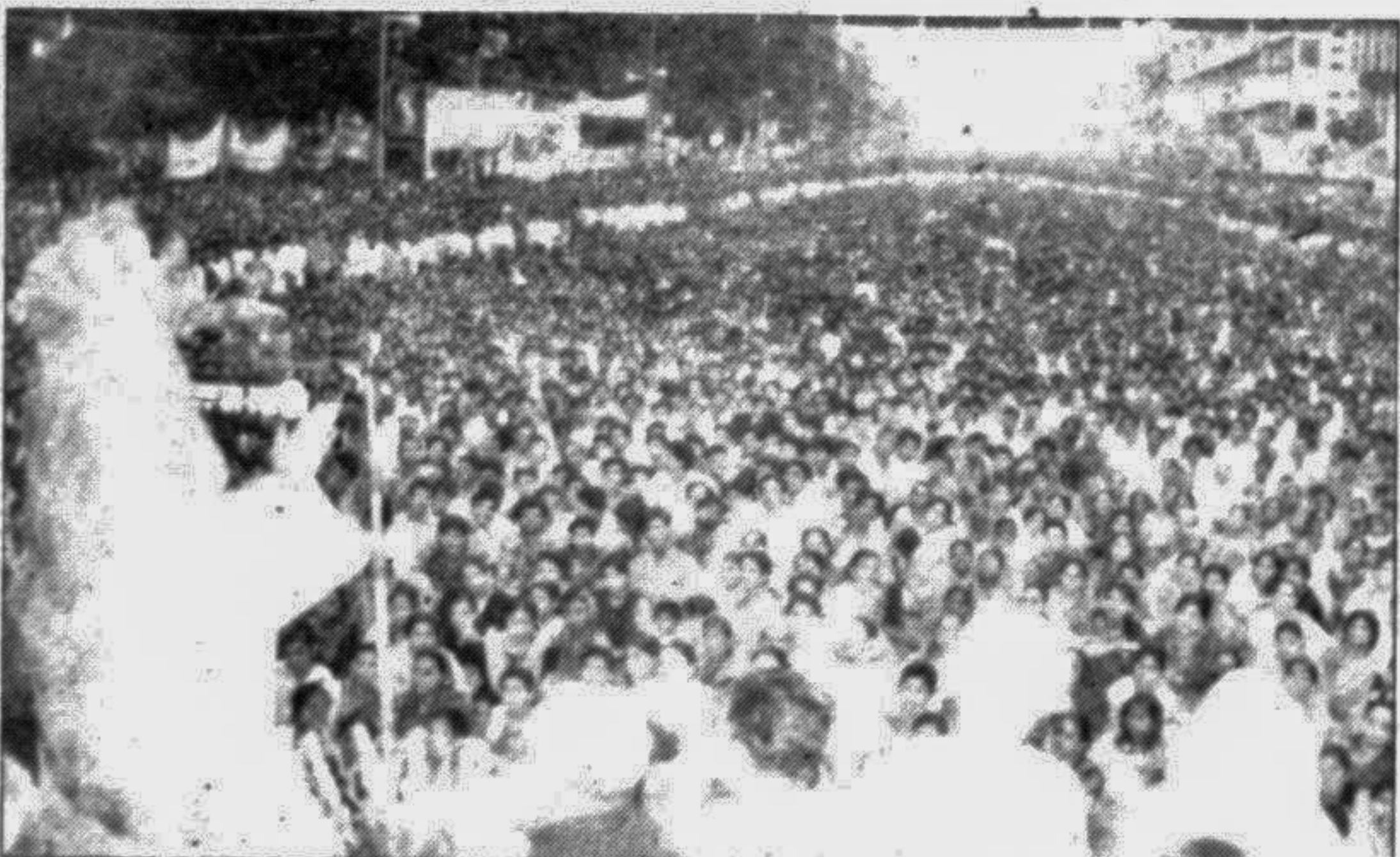
Awami League chief and Leader of the Opposition in Parliament Sheikh Hasina addressing a public meeting at Bangabandhu Avenue in the city yesterday.

The AL programmes: Protest day on October 1, 'padajatra' from Tongi to Mahakhali on October 9, 'train march' on October 16-18, See Page 12 Col 8