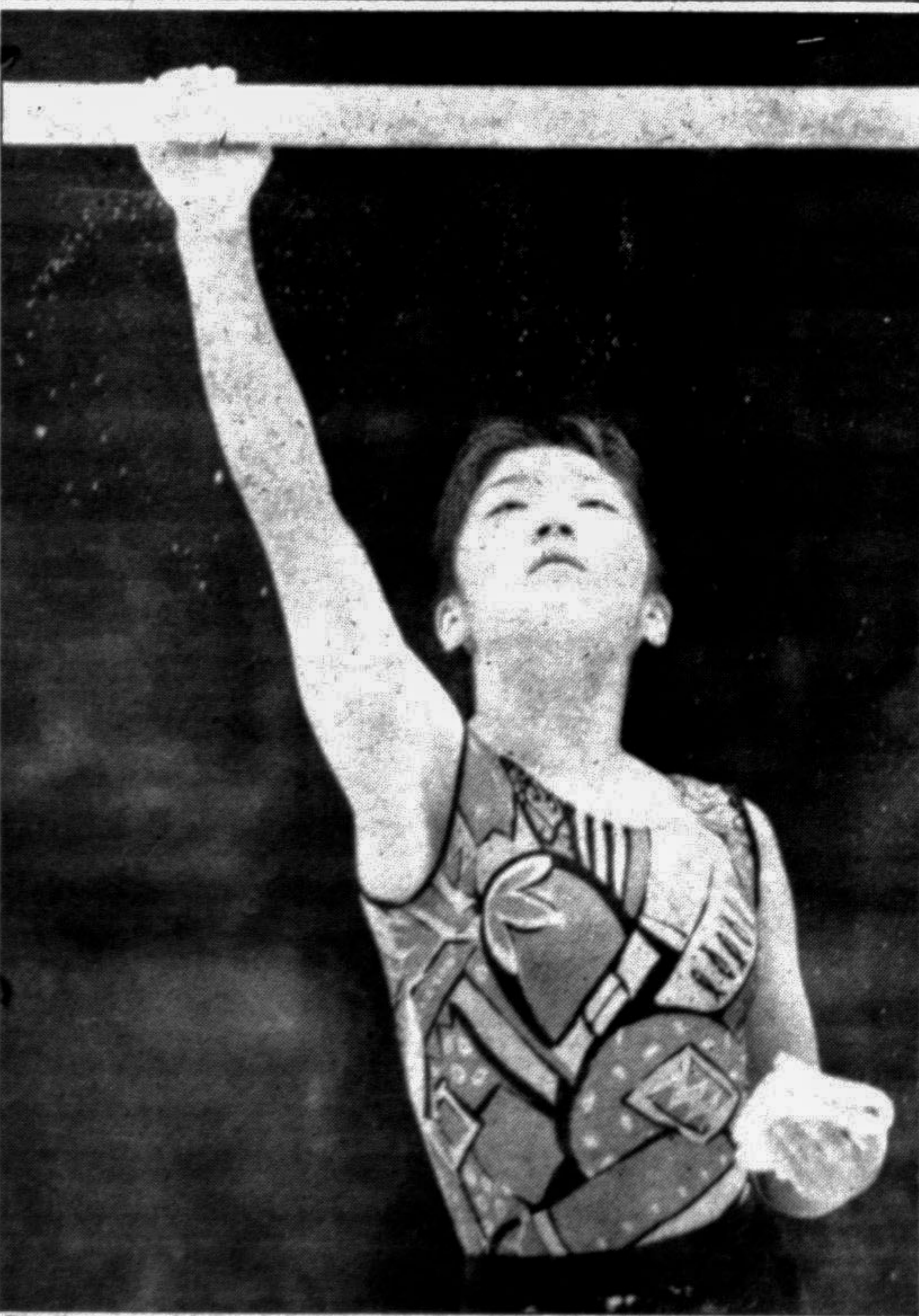
Risa Sugawara of Japan chalking the uneven bars during a training session to prepare for the 12th Asian Games at the Hiroshima Municipal Gymnasium yesterday. The Games get underway from Oct 2.

BRISBANE, Australia, Sept 27: An order banning race meetings in southern Queensland state was extended Sunday in an effort to prevent the spread of a mystery illness that has killed 13 thoroughbred horses, reports AP.