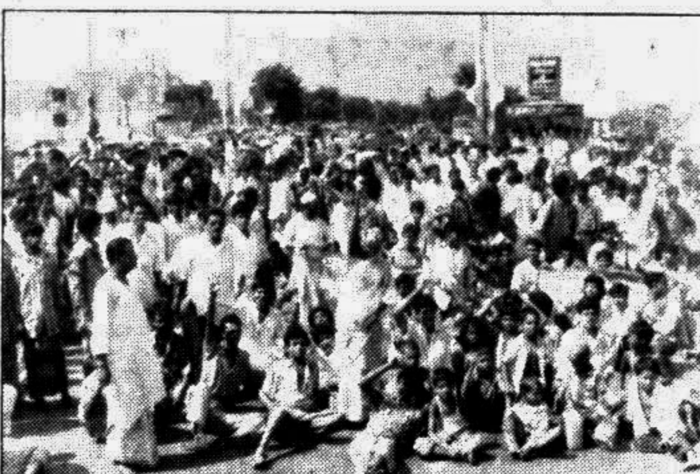
Activists of the opposition parties blocking a road at Demra during yesterday's barricade programme.

The neglected lane of road at last exacts its revenge. But is there no other way of responding to the appeal of this portion of road? There are thousands and one acts of indiscipline committed by the road users. Just pay enough attention to correct this one faulty way of traffic alone — the result may be pleasantly surprising.