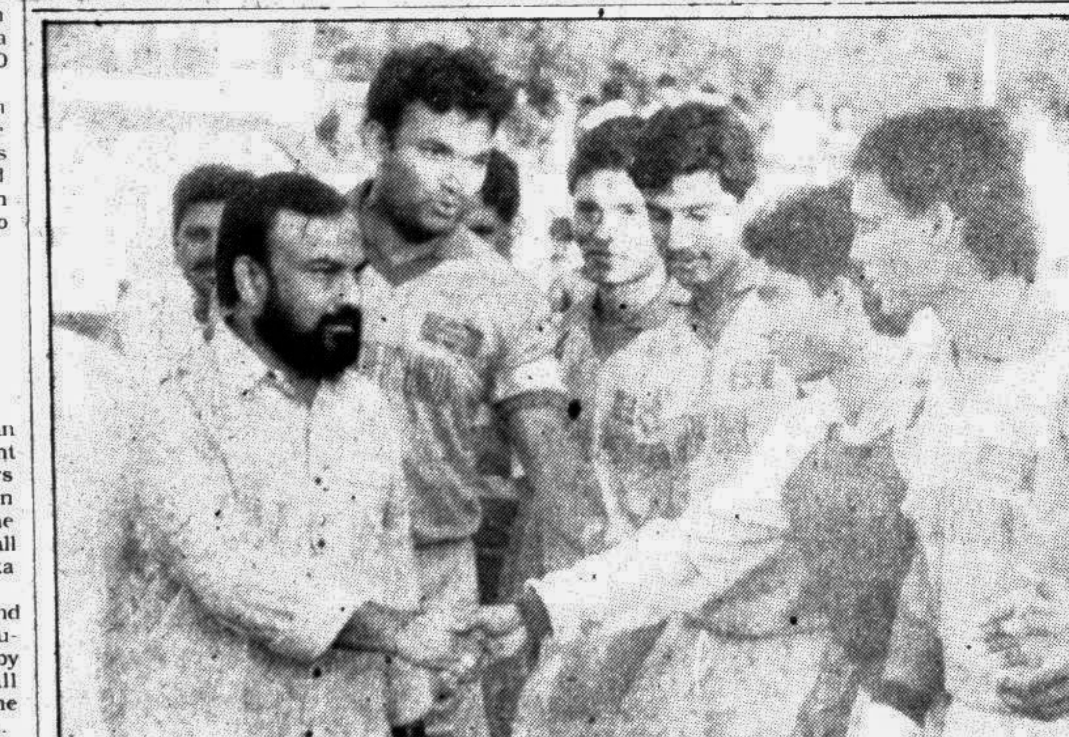
State Minister for Youth and Sports Sadeque Hossain is being introduced to the players on the opening day of the Rear Admiral M A Khan memorial handball tournament which got underway at the handball court adjacent to the Dhaka Stadium yesterday.

"Who (my opponent) is doesn't matter but I hope it's as soon as possible. I want to fight again in about three months time."