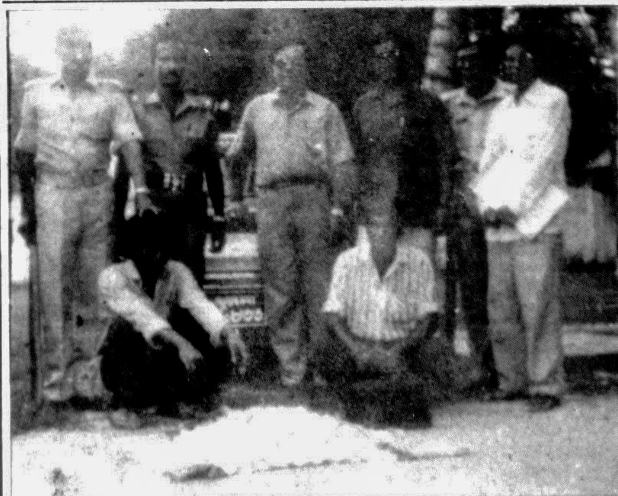
GOPALGANJ: Huge quantities of banned medicines were recently seized in the district town from a private car heading for the capital from Khulna. The drugs included 'Tidijesic' injection bottles. The value of the drug was estimated to cost about Tk 2.5 lakh. Two persons were arrested.

We only hope that the respective departments and authorities must be able to contain the floating oil and remove the sunken ship to save the fish and forest resources and clear the port channel. Mongla Port and the Sundarbans, both so vitally important to our economy, certainly deserve optimum care from the government.