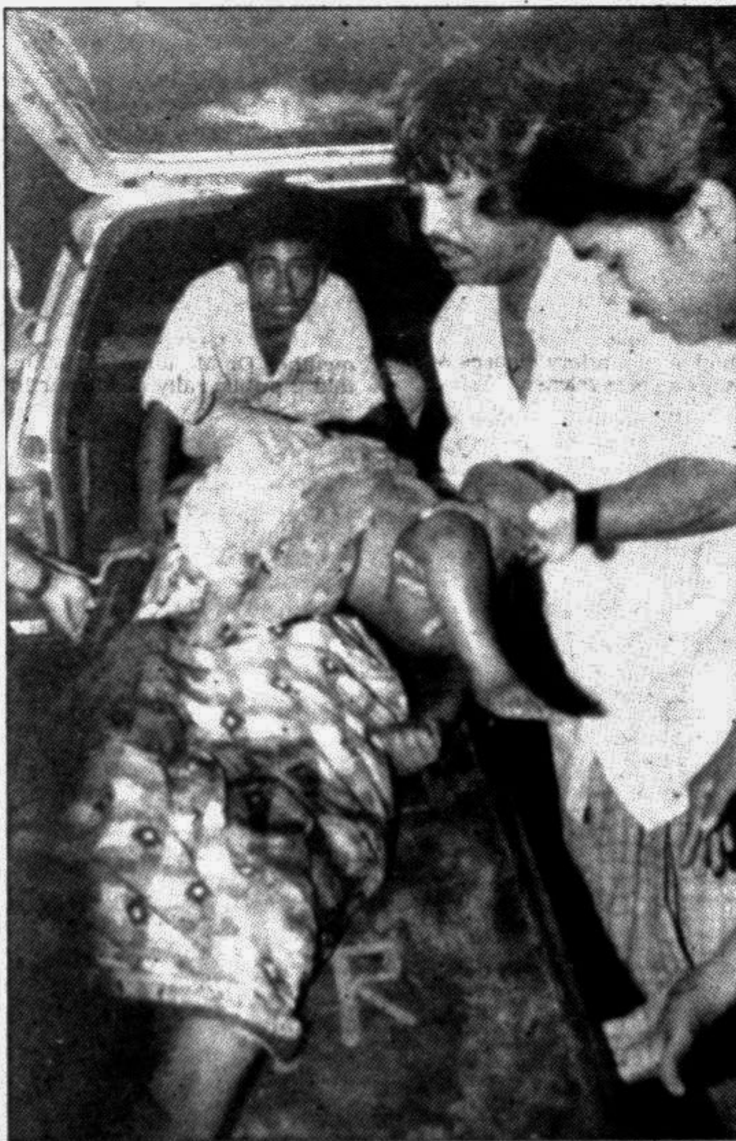
Two were killed, including a kid, while a speeding bus knocked them down on the street at Khilkhet in the city yesterday.

The national dialogue on jute, scheduled to be held on September 29 at Hotel Purbani, has been postponed due to unavoidable circumstances, reports BSS.