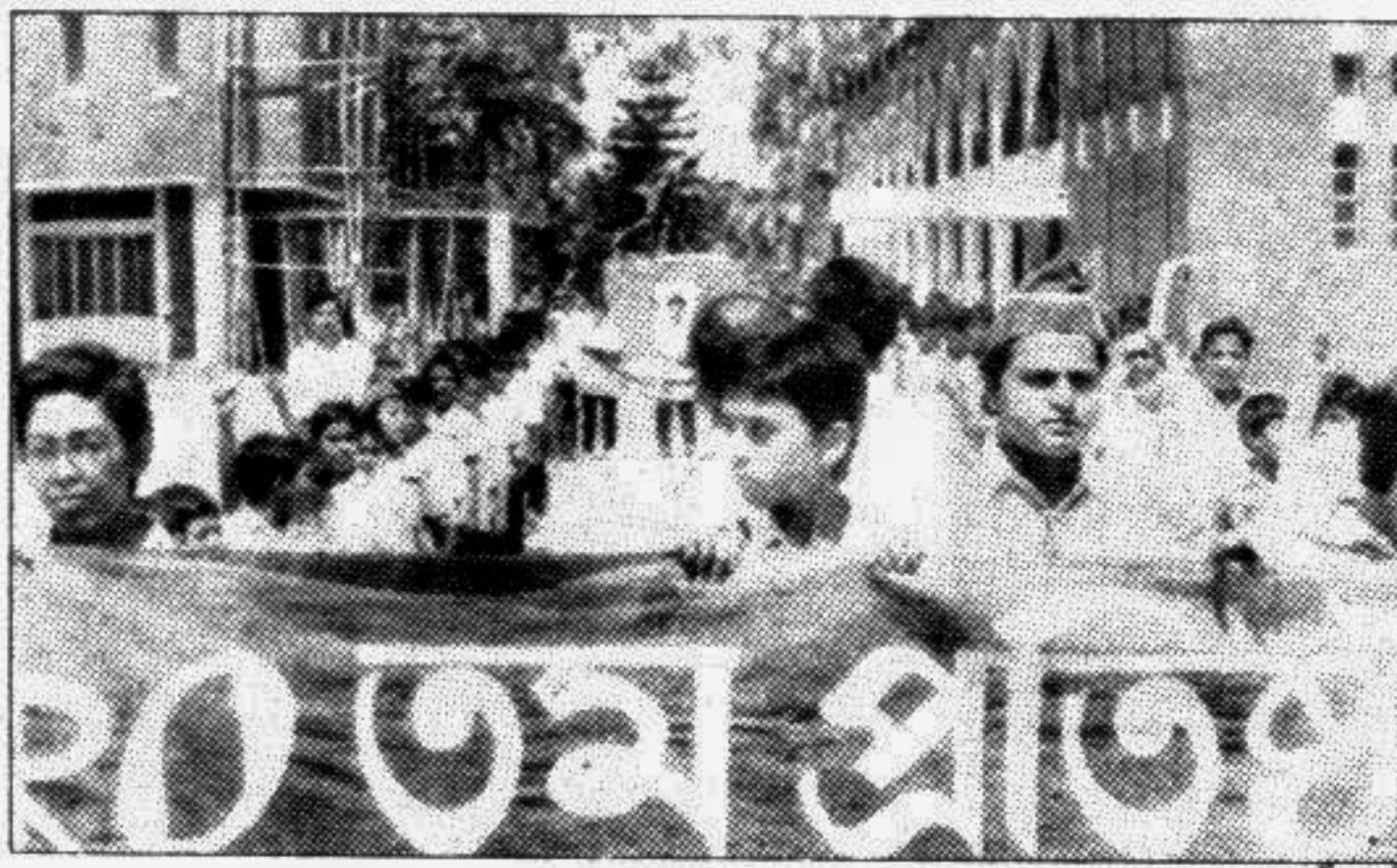
The Phulkunri, a juvenile organisation, brought out a procession in the city yesterday to mark its 20th founding anniversary.

The Food Minister directed all the project directors and implementing agencies concerned to take all necessary steps to implement these projects in due time with the maximum utilisation of resources sanctioned in this regard.