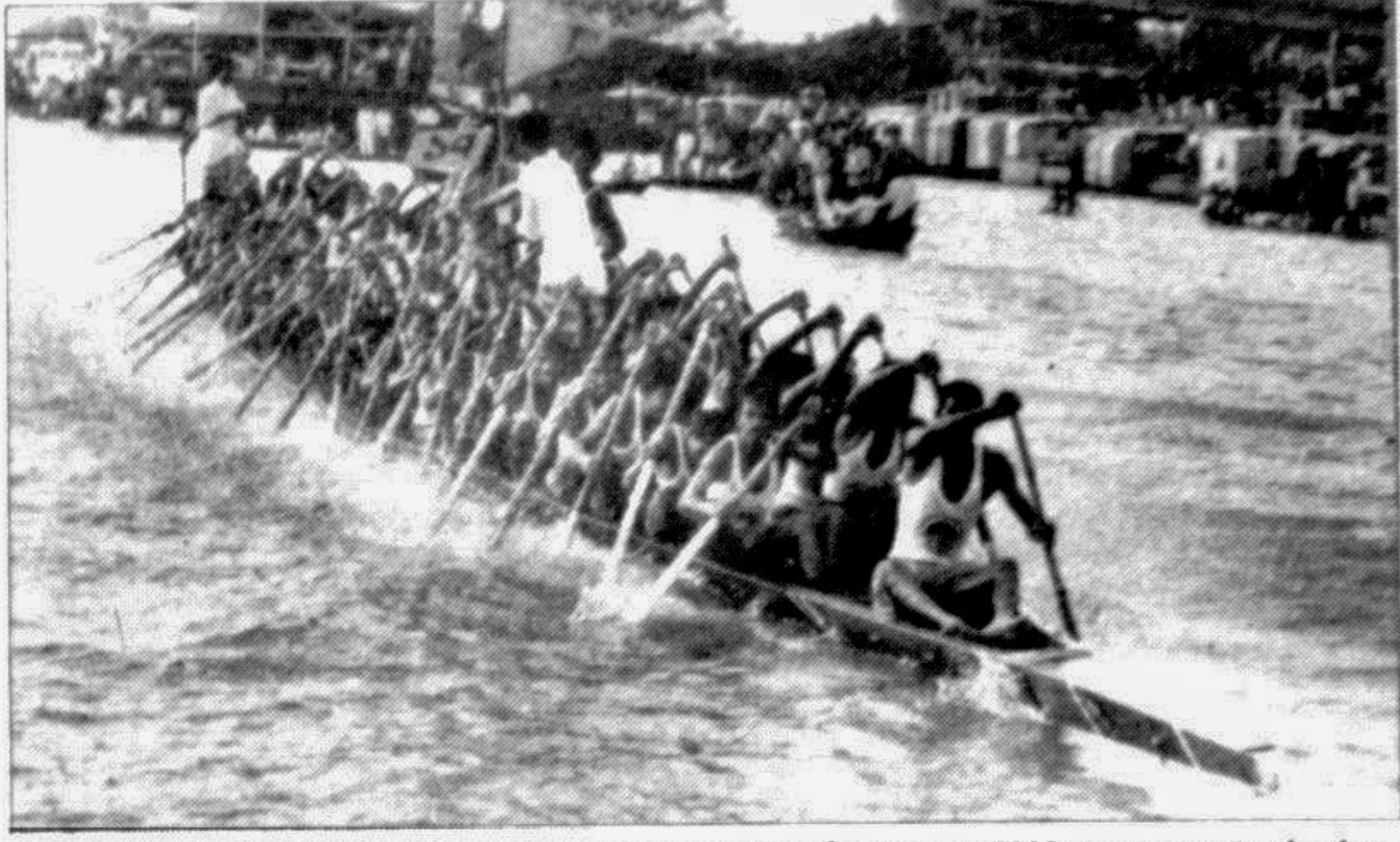
Janata Express' of Pabna DSA on the way to winning the 50-man 2000-metre race in the day-long Navana 19th national boat racing championships, held on the river Buriganga near Sadarghat in the city yesterday.