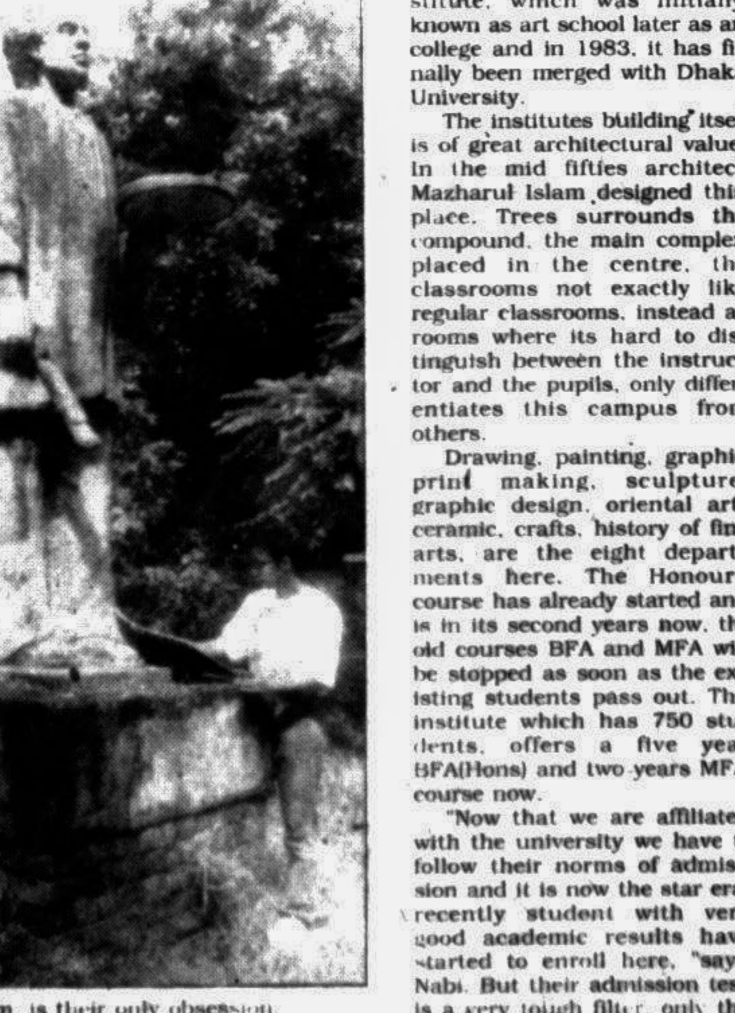
Materializing their dream, is their only obsession.

Matters of the Heart I'm a 15-year old girl and have an older sister and a brother. When my brother and sister were in their teens, my parents always listened to their problems, but neglecting me. My father is mostly out of town. My sister is earning and gives money at home and therefore my mother never speaks against her dominating nature. Because of their attitude I can't concentrate on my studies. I want to go abroad but my father can't afford it. Please advice. Anonymous. It is probably your own imagination that your mother is neglecting you. Parents usually love their children equally. Perhaps she has a lot on her mind and his unknowingly been aloof. The best thing to do is to let her know how you feel without getting agitated. As far as going abroad, you have plenty of time to prepare for that. A lot of young people have applied for scholarships and received them. Why don't you do, the same?