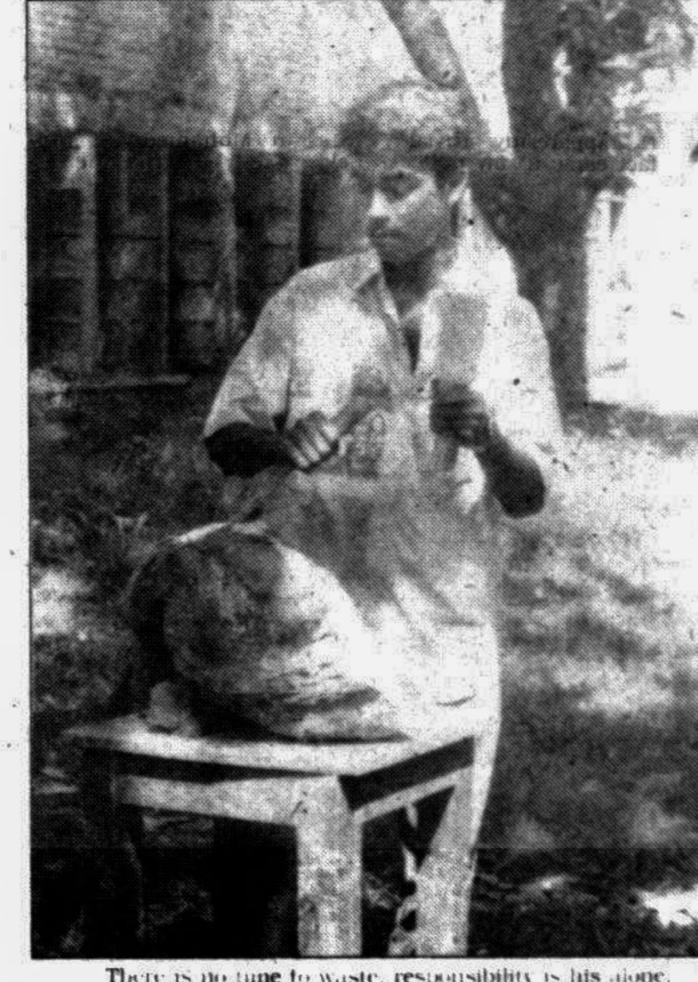
There is no time to waste, responsibility is his alone.

like earning extra money. But if an artists completes may be 100 paintings a year only two or ten if he is lucky, would be sold. His energy, time and his love are all over looked. To make matters worse their instruments such as paints brushes, canvas etc are treated as luxury items and so are very expensive. A certain brand of number