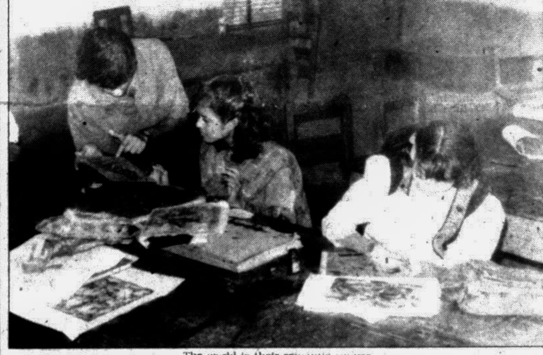
The world is their romantic canvas.