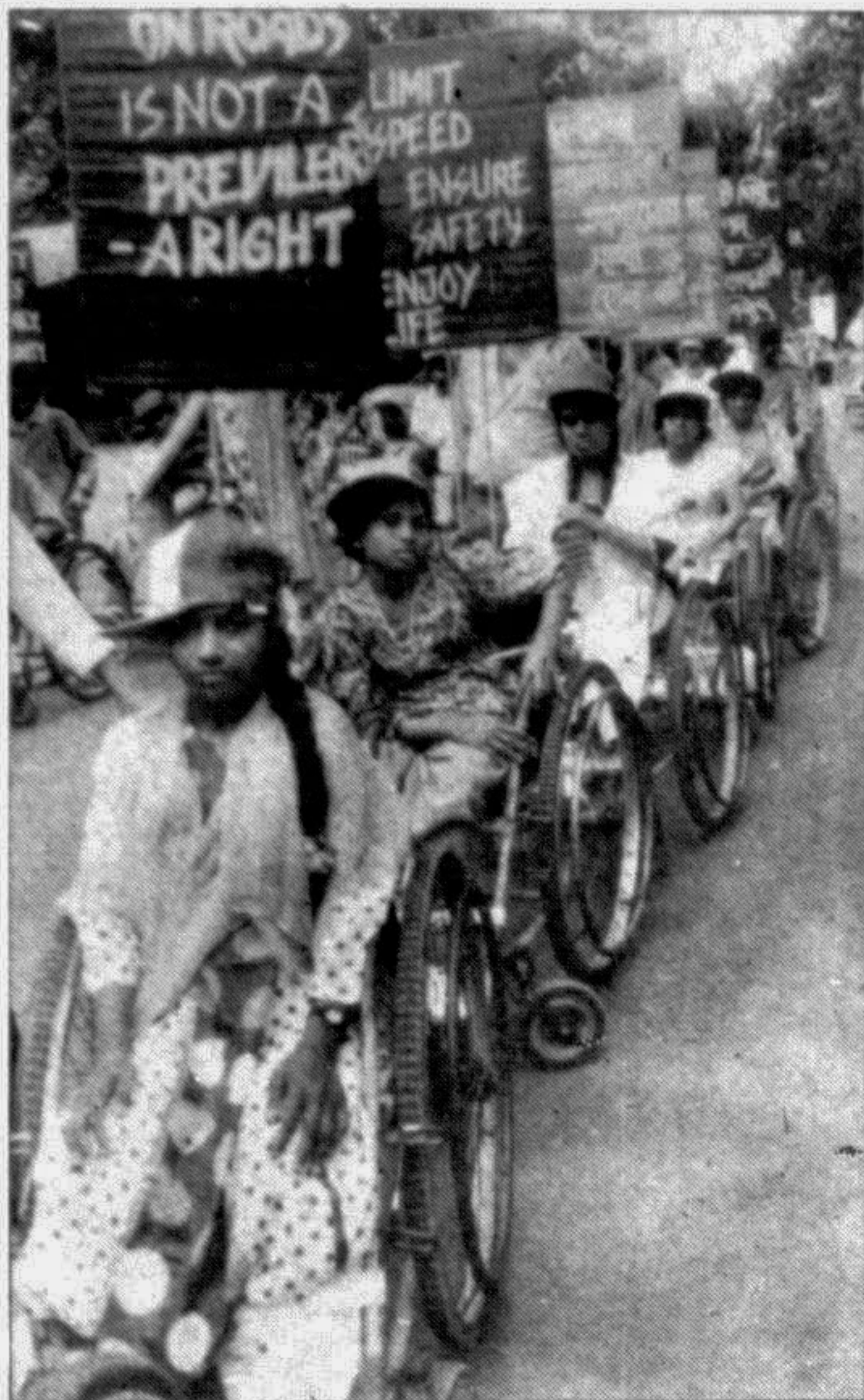
The Centre for Rehabilitation of the Paralysed, a British-aided NGO in Savar, brought out a wheelchair rally in the city yesterday with disabled persons carrying colourful banners and placards inscribed with slogans against road accidents.