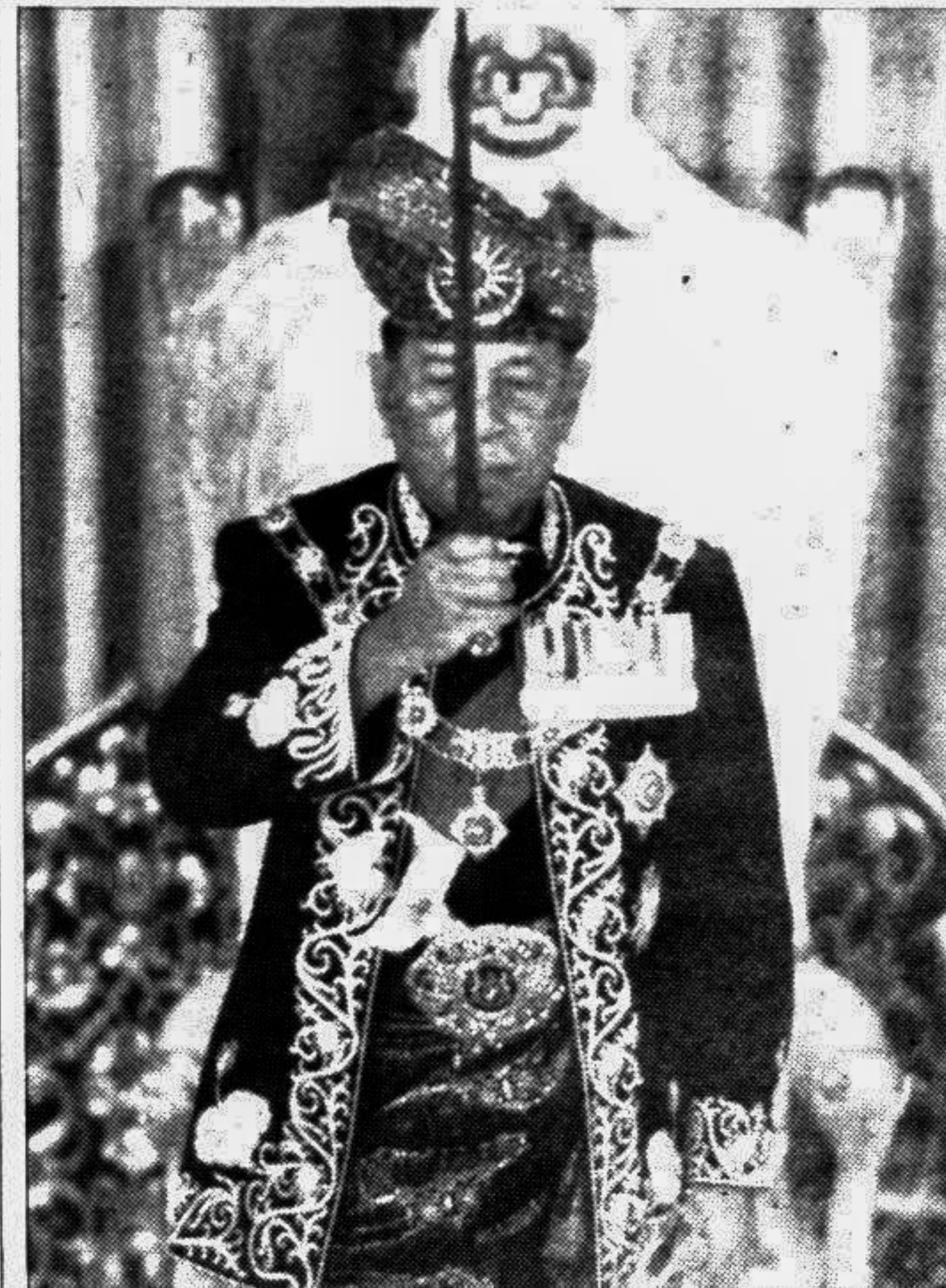
Malaysia's new King Tuanku Jaafar holds a kris, a traditional Malay sword, before kissing it yesterday to mark his installation as Malaysia's 10th King at the National Palace in Kuala Lumpur. The 71-year-old former diplomat will rule for five years.