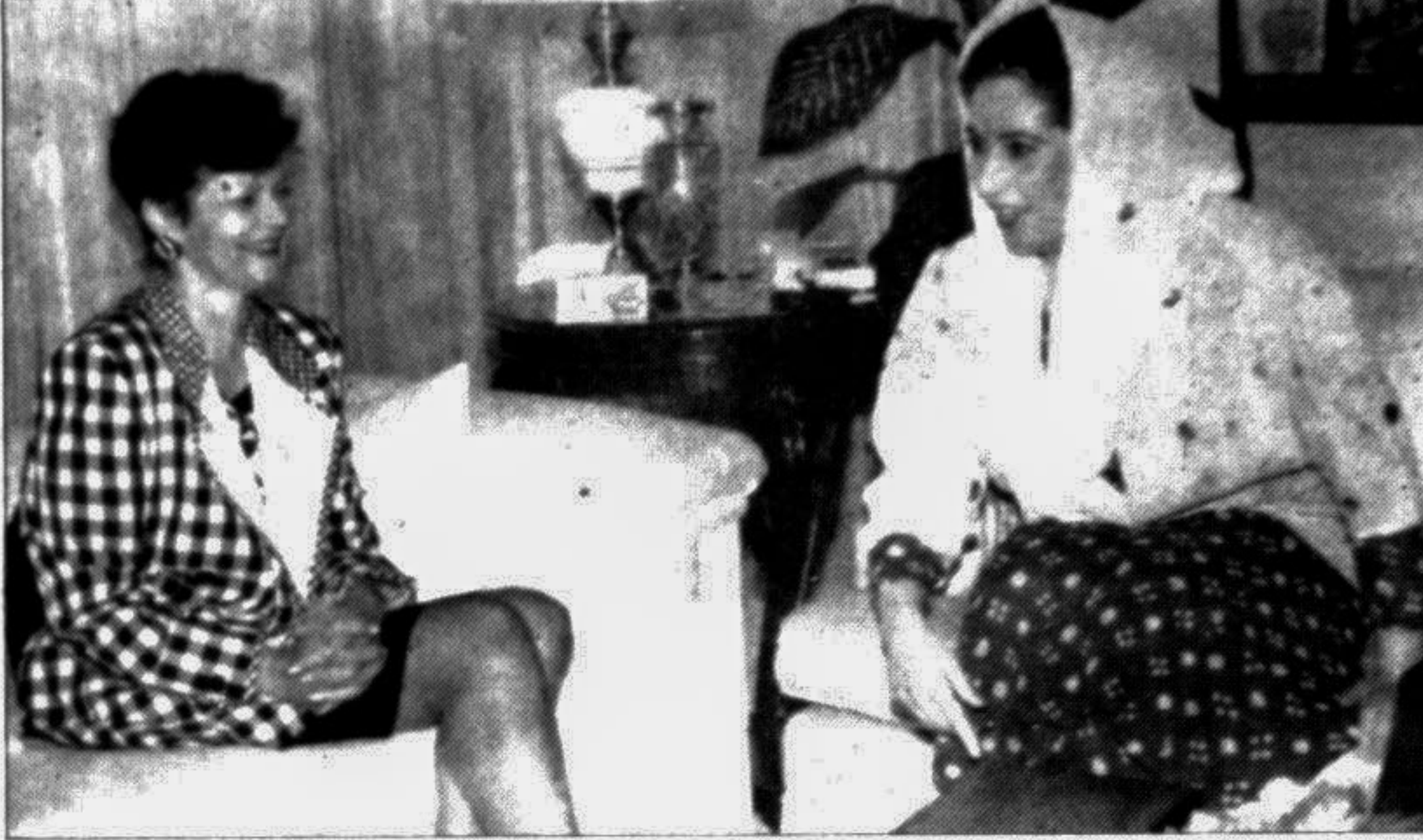
Pakistani Premier Benazir Bhutto (R) and United States Energy Secretary Hazel O'Leary smile during a meeting in Islamabad yesterday. O'Leary, who arrived here Wednesday on a four-day official visit, said that her mission was clear — to support specific business opportunities, identify potential barriers and streamline joint ventures and sustainable technologies.