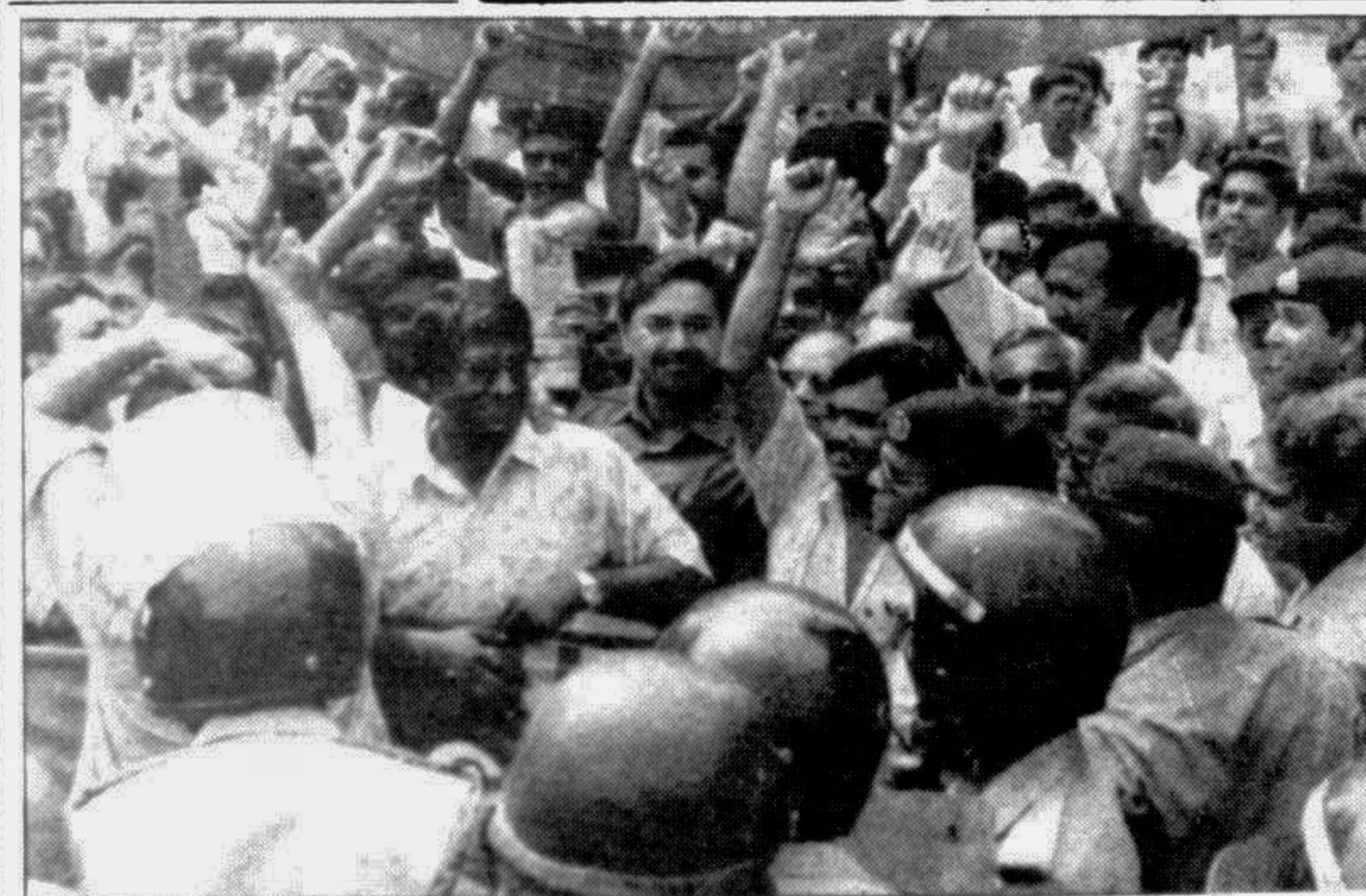
Police blocking a Prokrichi march towards Prime Minister's Secretariat at the Farm Gate in the city yesterday.