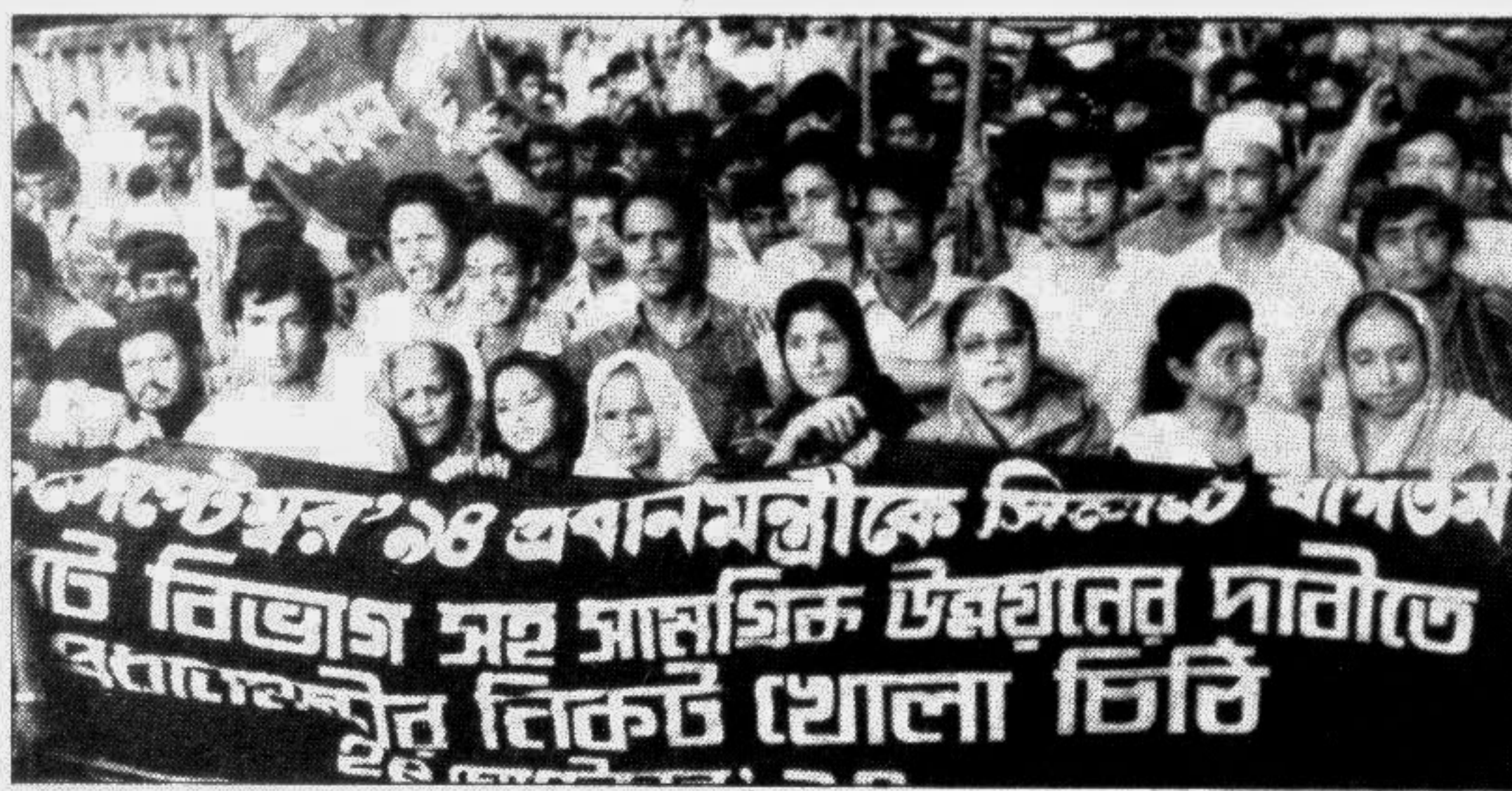
A rally of the Sylhet Bibagh Andolan proceeding towards Prime Minister's Secretariat in the city to handover a memorandum demanding Sylhet division yesterday.

No prying eyes, no lewd comments, no sniggering or guffaws from the nosy masses to distract you at the libraries. So they say. On the contrary, they are the ones who disturb quite a few serious readers out there.