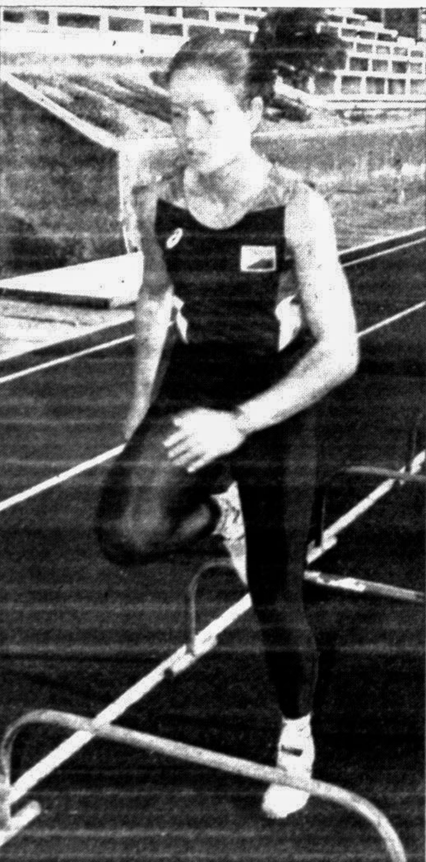
Filipino sprinter Lydia de Vega practices in Manila yesterday. De Vega, 29, will be competing in the 100 metres at the Hiroshima Asiad next month. She won the event at 1986 Games in Seoul but could not defend her title four years later in Beijing after giving birth to a daughter.