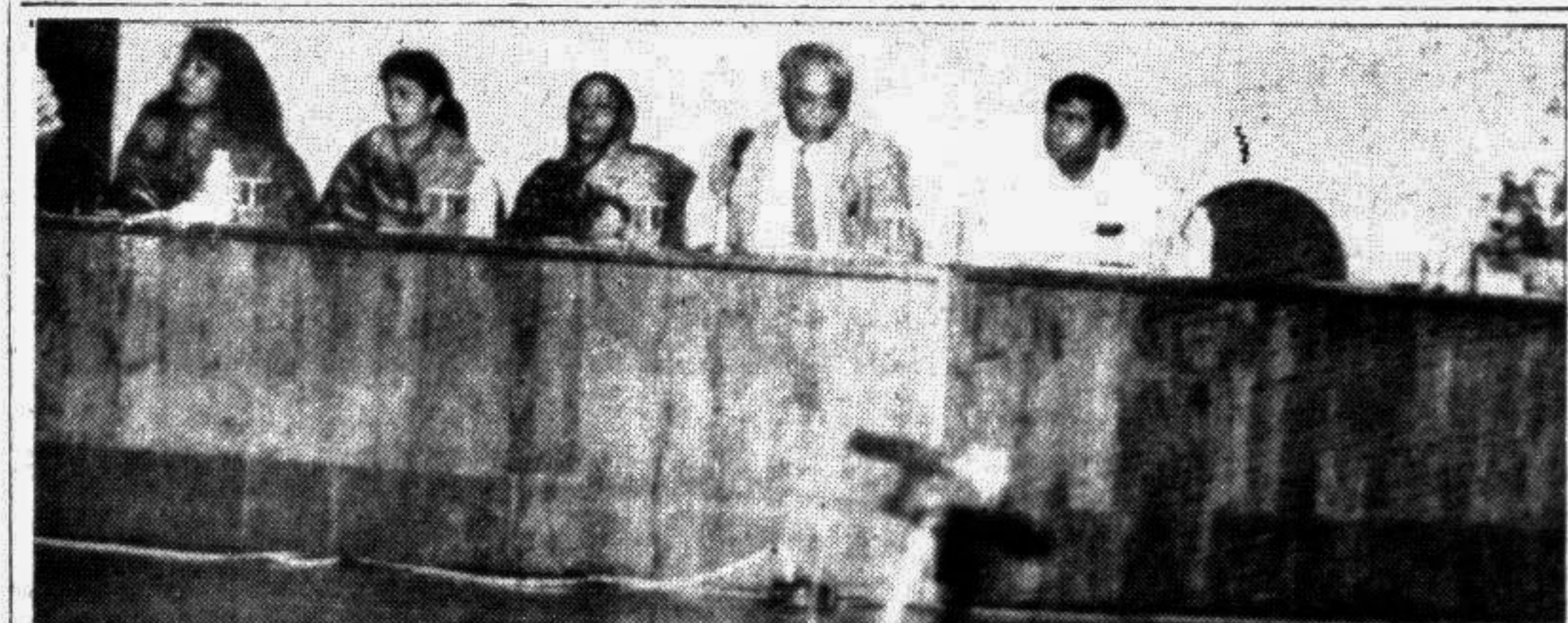
The fifteenth annual central meeting of Bangladesh Thai Aluminium Limited plc was held at BCIC auditorium in the city yesterday. The company declared a dividend of 13.5 per cent for 1993.

Management reserves the right to accept/reject any or all the tenders and increase/decrease the quantity of the item without assigning any reasons whatsoever.