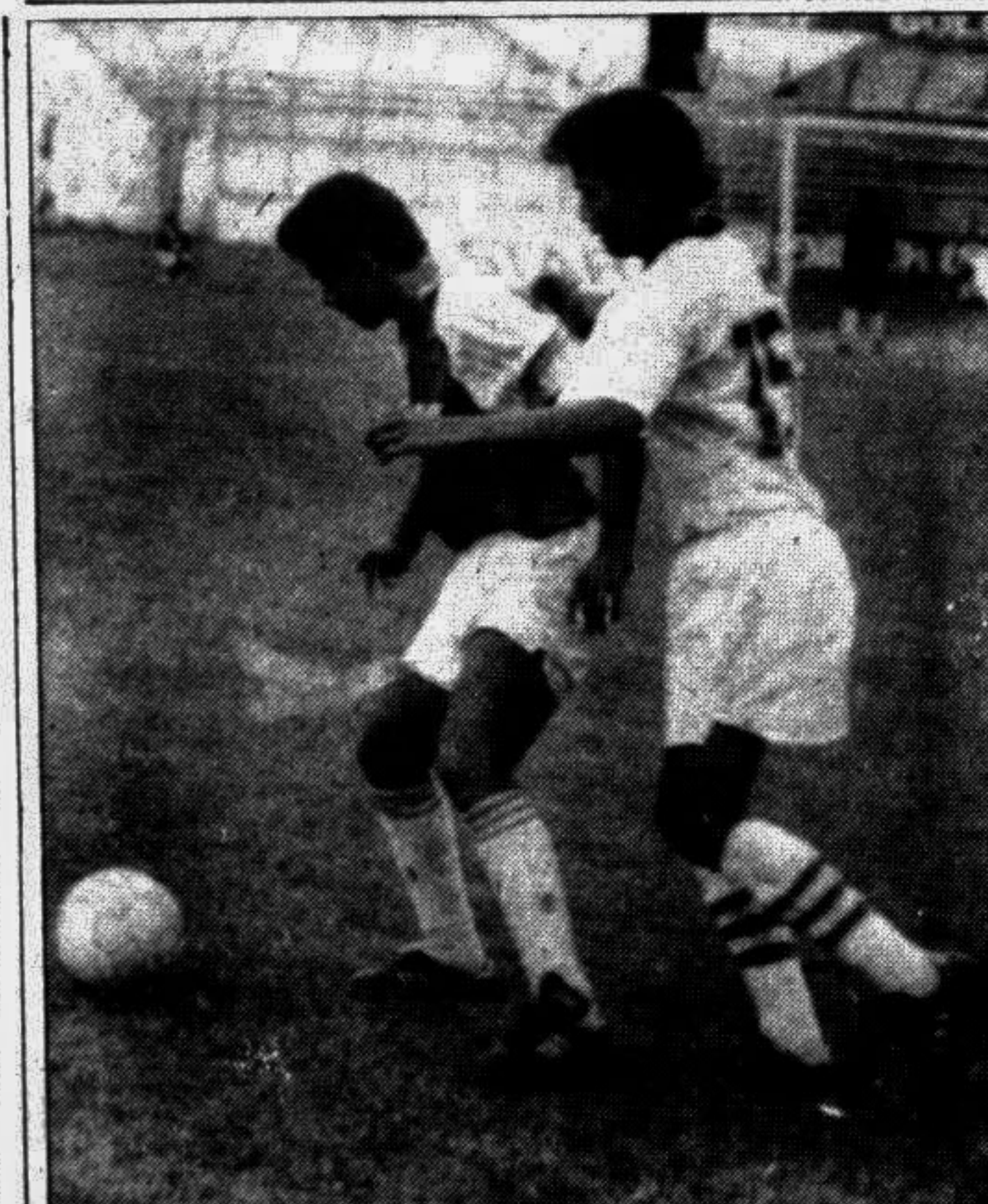
Action from yesterday's Star First Division match between Sadharan Bima and Muslim Institute at the Dhaka Stadium. Bima won 3-1.

regards his assignment no more than a punishment.