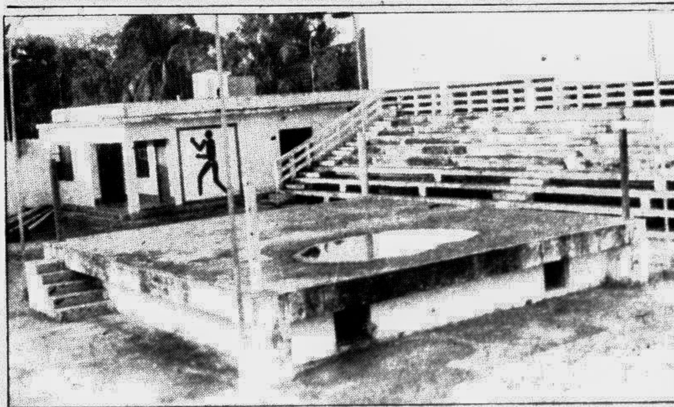
EMPTY CANVAS — a pool on the pavement, meant to be a boxing ring at the Mohammed Ali Boxing Stadium succinctly sums up the condition of sport in the country. With the officials only concerned about self promotion, it looks like Moazzem will seek asylum while the ring will ring hollow.