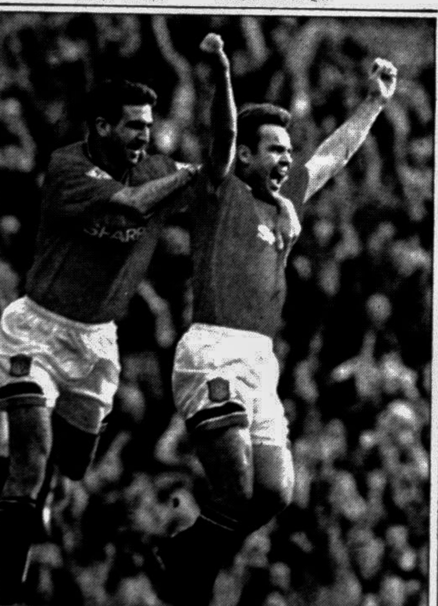
Manchester United striker Brian McClair (R) is congratulated by teammate Eric Cantona after scoring United's second goal against Liverpool during their English Premier league clash at Old Trafford on Sept 17. United won 2-0.

In handball, Bandura Holy Cross High School trounced Mymensingh Zilla School 14-5 to clinch the title while in the girls' event Vidyayarni Noon High School edged out Mymensingh Vidyayarni School 7-6 for the championship.