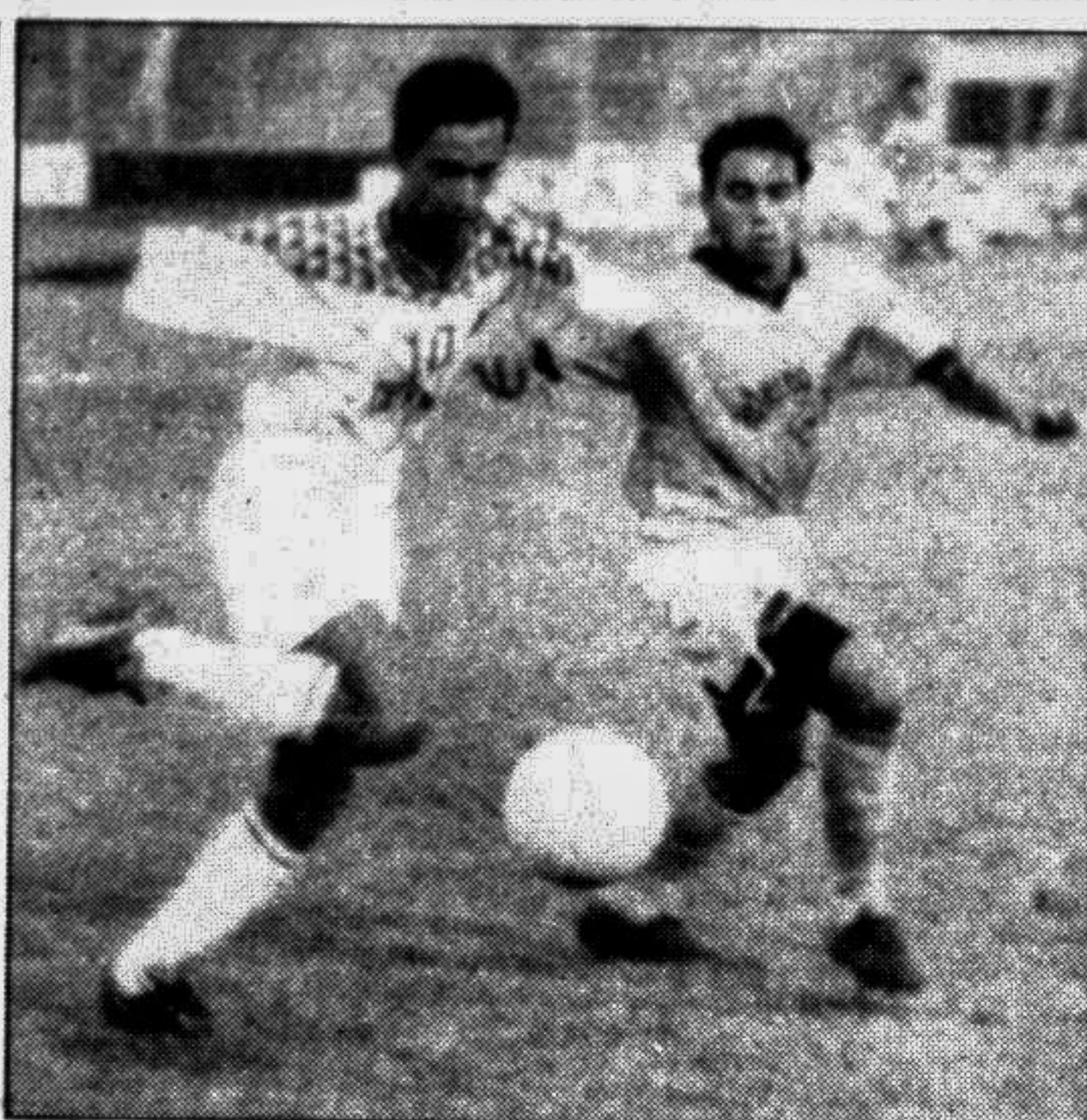
Action from yesterday's Star First Division football league encounter between East End Club and Dhanmondi Club at the Dhaka Stadium. The game ended 0-0.

If, for any reason, the organisers fail to muster at least four entries for Kabaddi then it will have to be excluded from the prestigious meet.