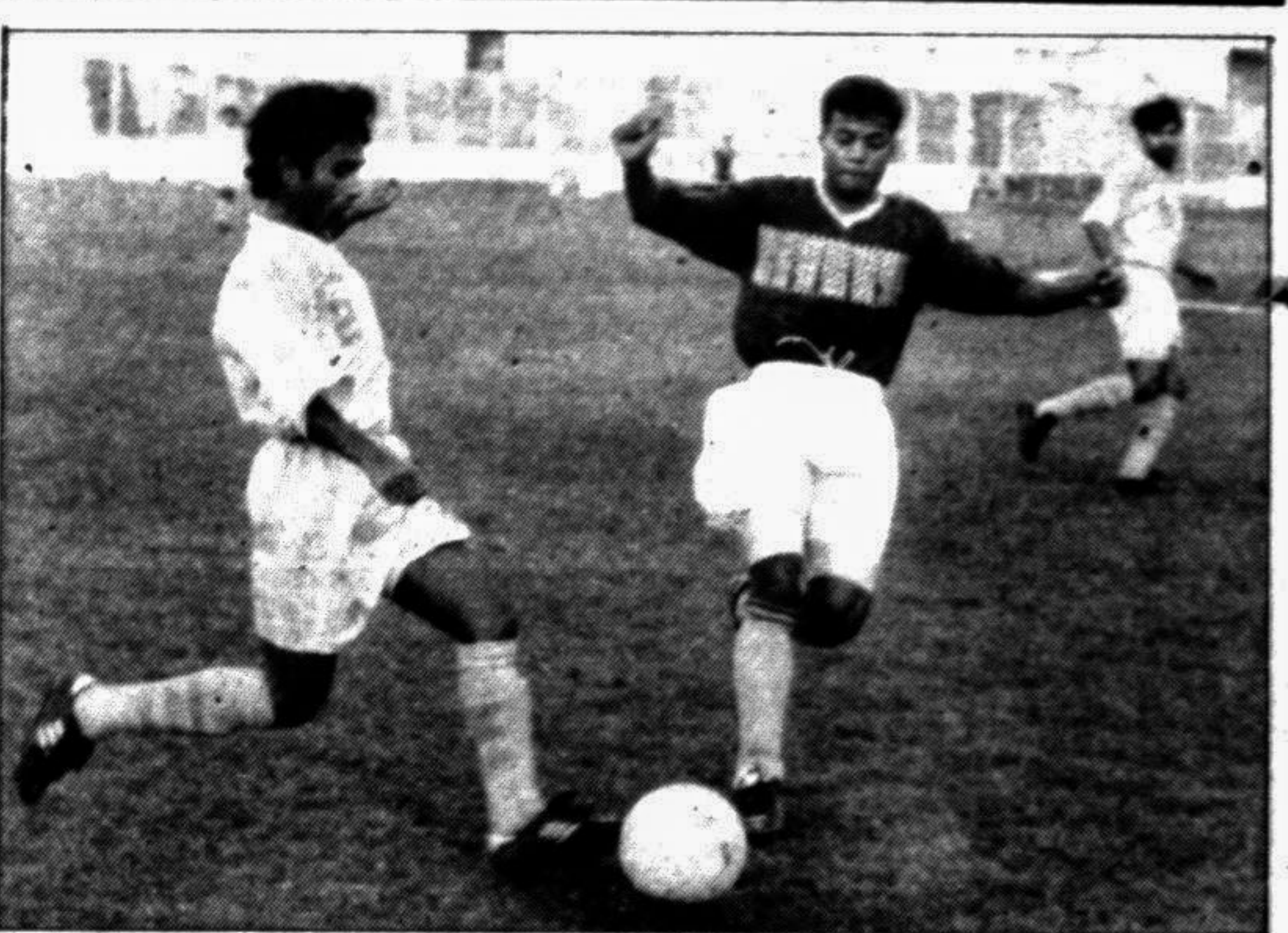
Action from yesterday's Star First Division football league encounter between Rahmatganj and Shantinagar at the Dhaka Stadium. The match ended in a one-all draw.