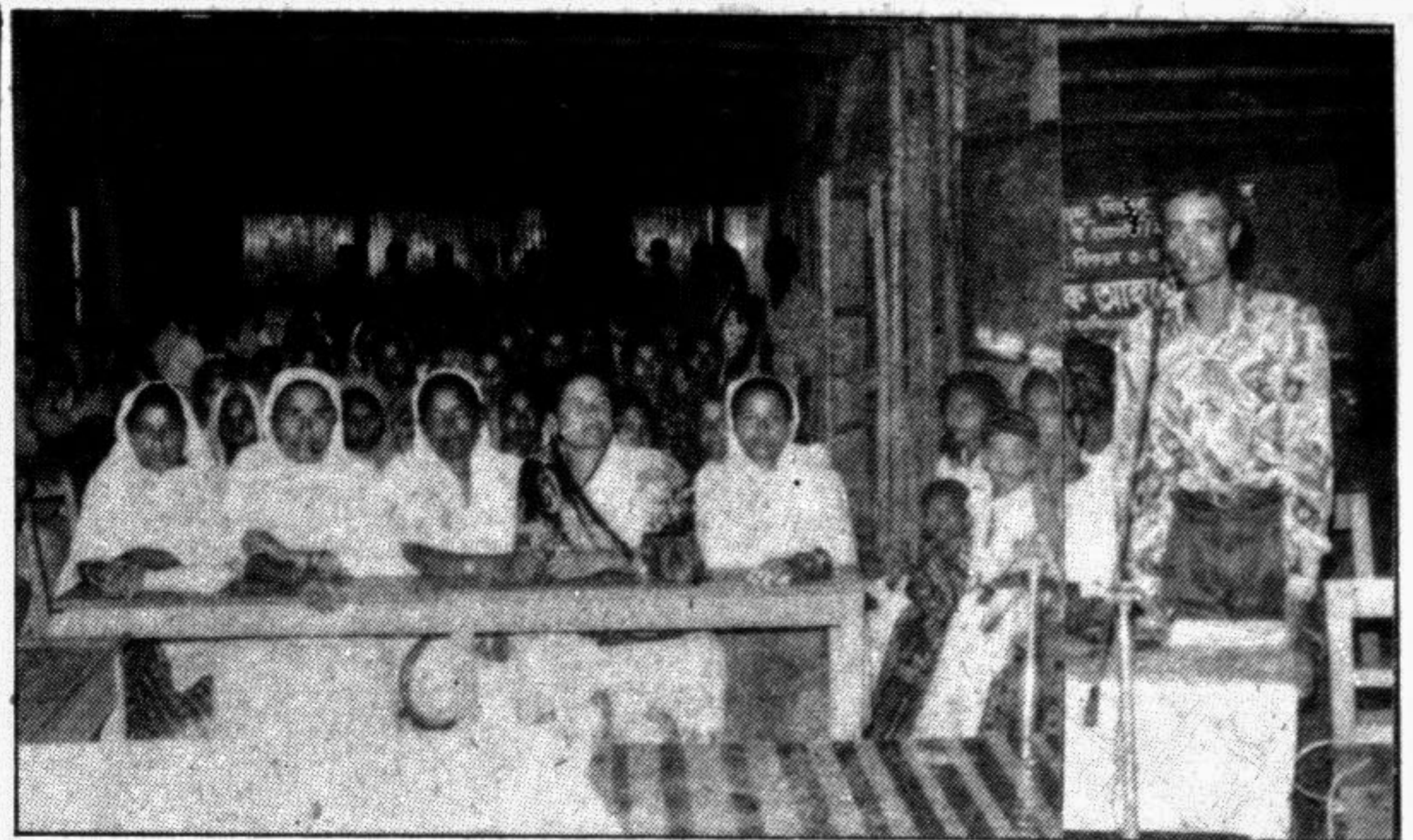
JAMALPUR: A programme on social mobilisation for mass education was held at the Durmut Soltankhali High School recently.

The abandoned foreign-made gun was recovered from an underconstruction shelter centre at Ambhagan railway colony under Doublemoothing thana.