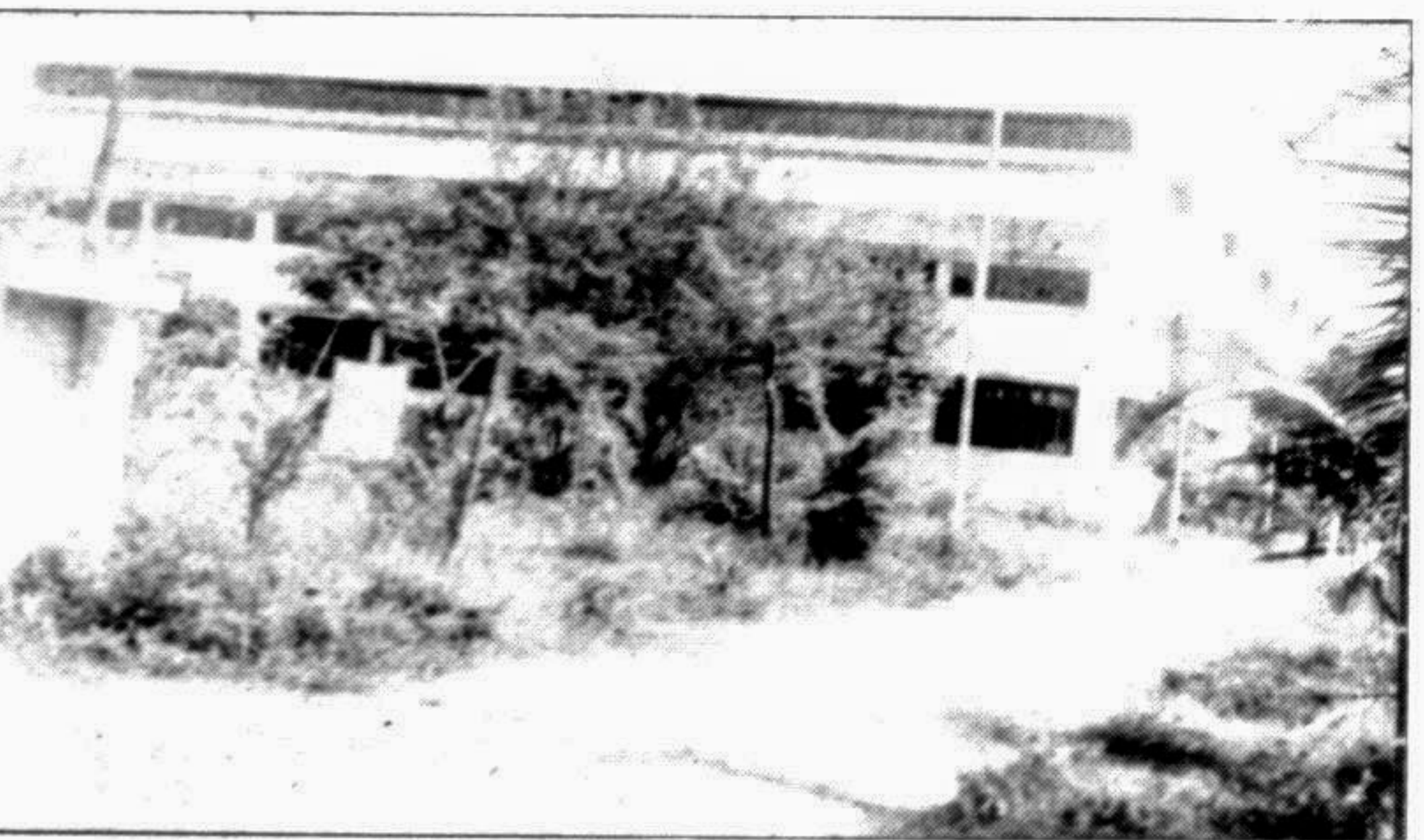
SIRAJGANJ: The services and facilities centre of Bangladesh Handloom Board in Belkuchi still remains inoperative even after two years of inauguration.

So far it is learnt that this college will be constructed near Kashiipur Higher School at Kashiipur, some two kilometre of Barisal town.