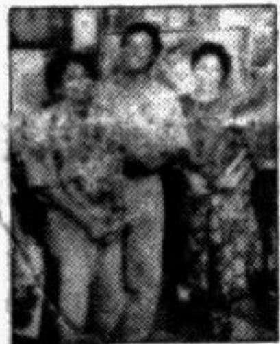
Young Painters with a Promise Page 3