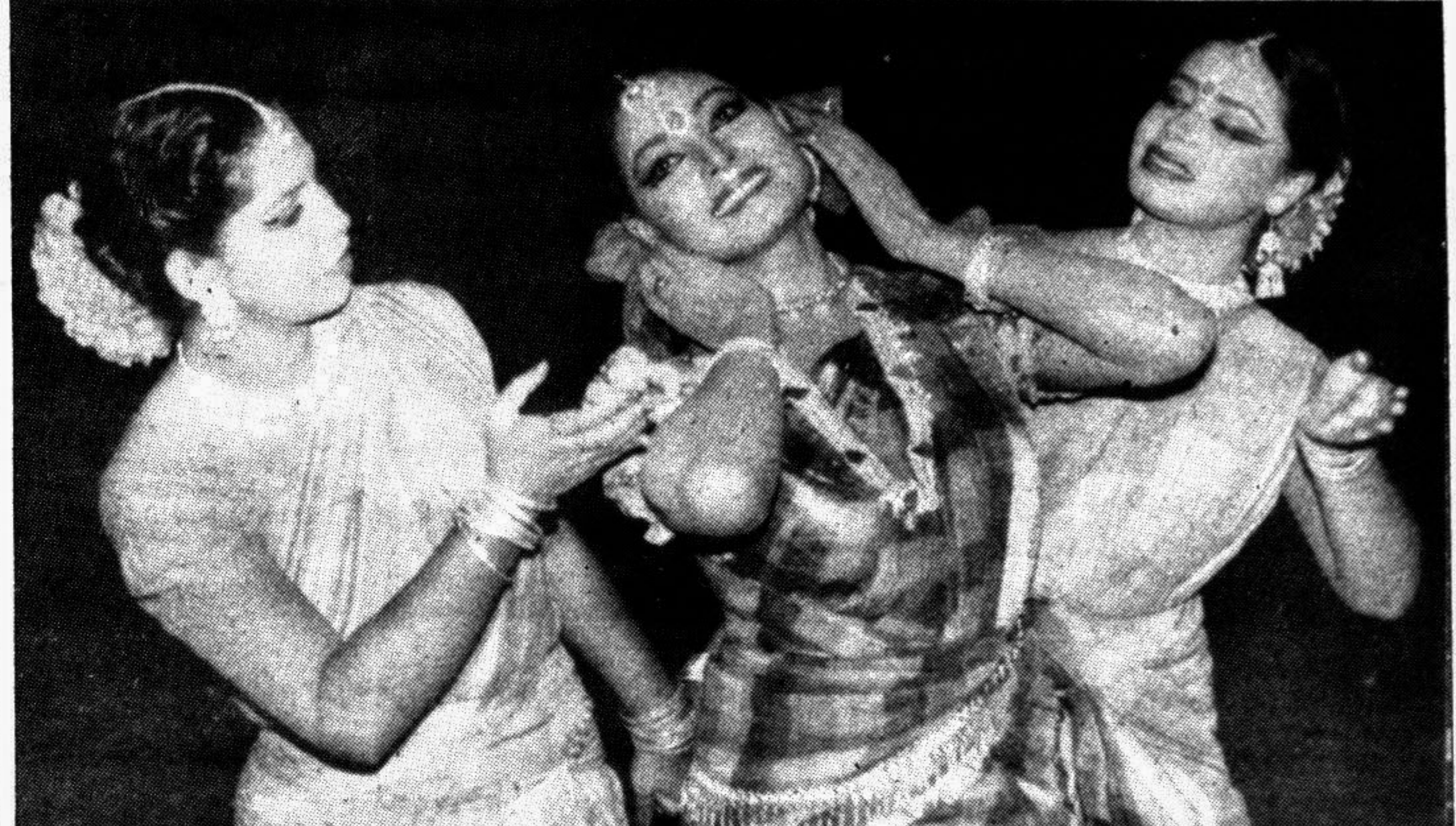
A sequence from the 'Battle of Bangladesh,' a dance drama based on the War of Liberation, staged at the Shilpakala Academy auditorium in the city yesterday evening as part of the 13th founding anniversary of the Bangladesh Ballet Troupe.

Continuing, he said that Parliament is the forum for such dialogue.