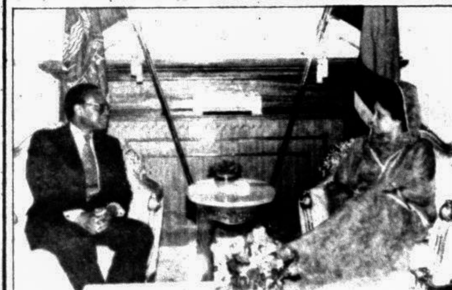
The visiting Commonwealth Secretary General Chief Emeke Anyaoku paid a courtesy call on Prime Minister Begum Khaleda Zia at her office in the city yesterday.