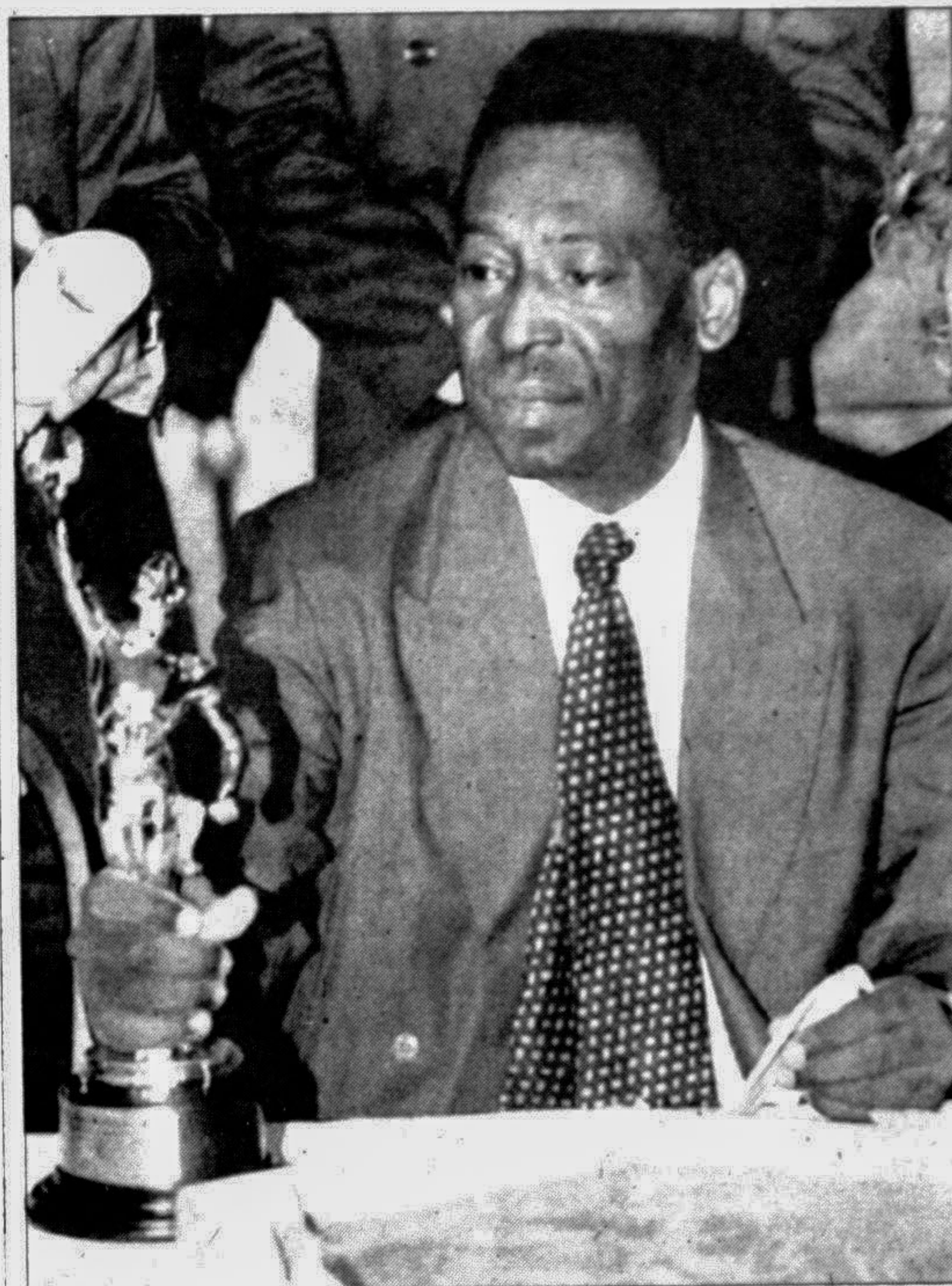
Brazilian soccer legend Pele gazes at the lifetime achievement award he received from the Sportsmen's Hall of Fame in Budapest on Sept 15. Pele will play in an exhibition match against a senior Hungarian team.

The club was reeling in 17th place in the 20-team league after losing five of its first eight matches this season.