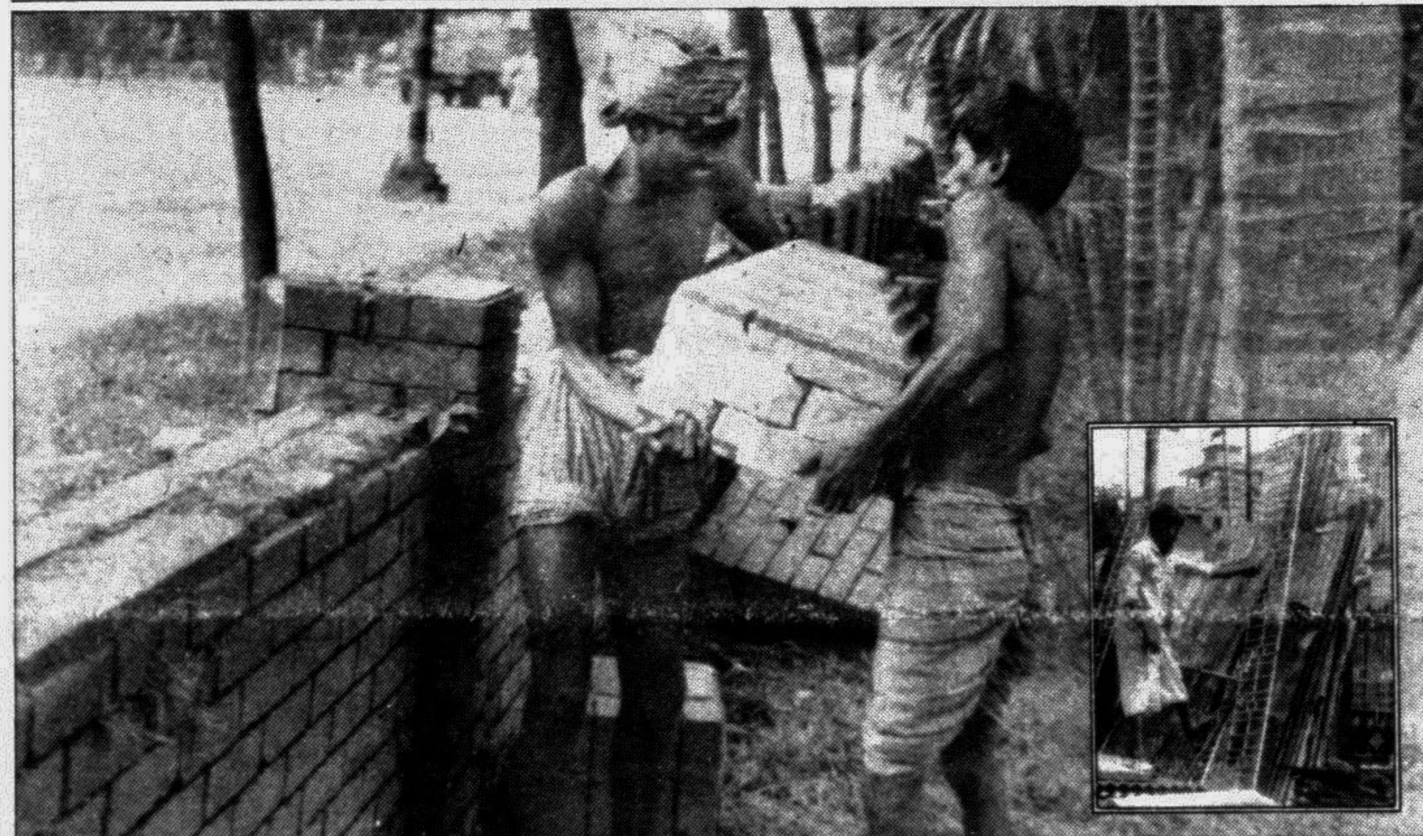
EASY PICKINGS: With bricks costing as much as they do these days, two friends here help themselves to some easy pickings along the south and western walls of the Ramna Park which was partially torn down by opposition agitators during last Saturday's Dhaka Siege. The iron grilles have long since been carted away, perhaps to one of such roadside shops in the older part of the city (inset), may be to be washed to the City authorities.