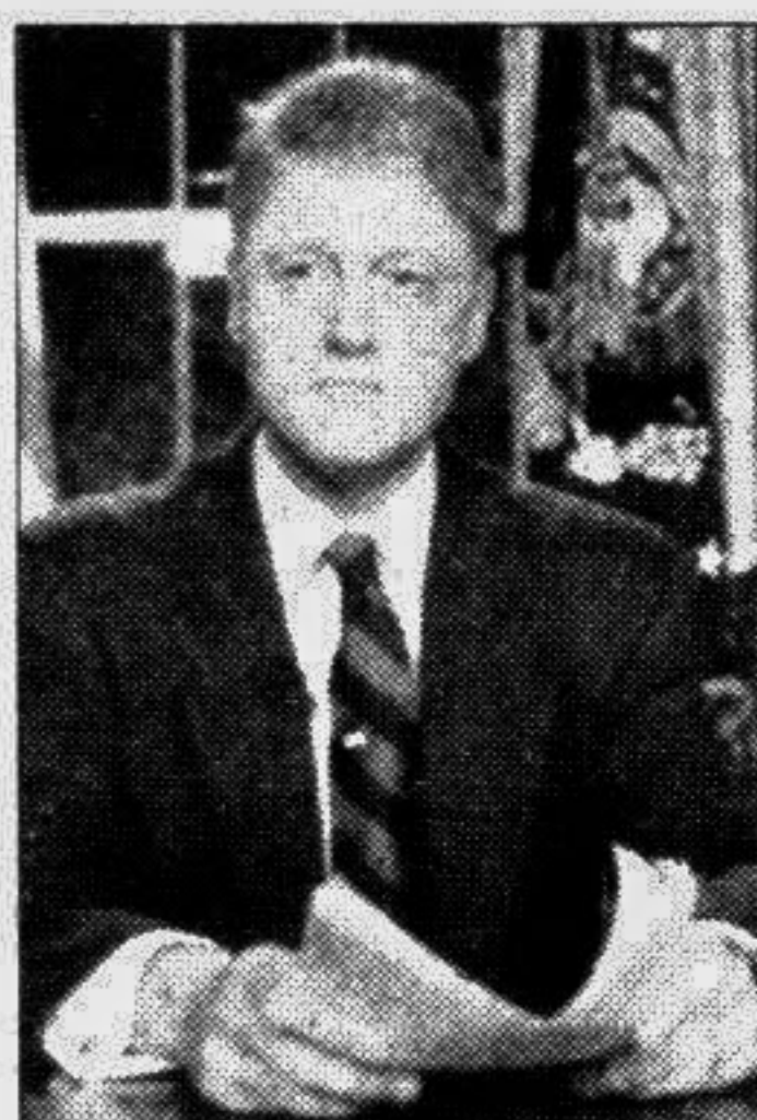
President Clinton addressing nation yesterday.

WASHINGTON, Sept 16: The Clinton administration said today the US invasion of Haiti could come within days and when it does, the main military mission would be over "in a matter of hours," reports AP.