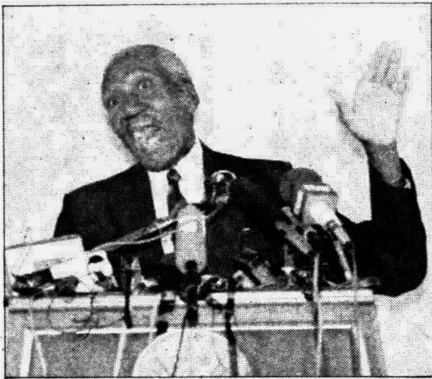
Haitian President Emile Jonassaint addresses a late evening press conference Wednesday in Port Au Prince, where he vowed Haiti will stand firm in the face of a threatened invasion by the US.

FORT-AU-PRINCE, Sept 15: Despite an increasing threat of US invasion, Haiti's military rulers were standing their ground and refusing to give up power, reports AP. "The government will continue to fulfill its mission and will not fail to fully pursue defence of the republic," the army-installed president, Emile Jonassaint, said at a