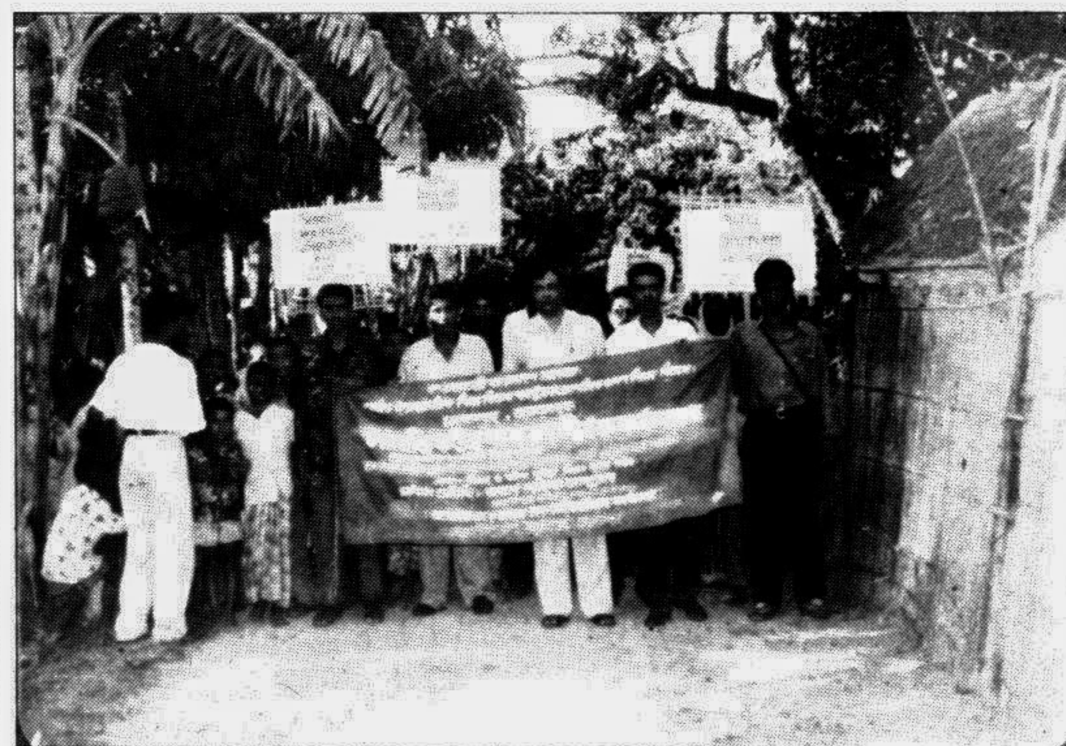
JAMALPUR: Integrated non-Formal Education Programme, Jamalpur brought out a rally recently.