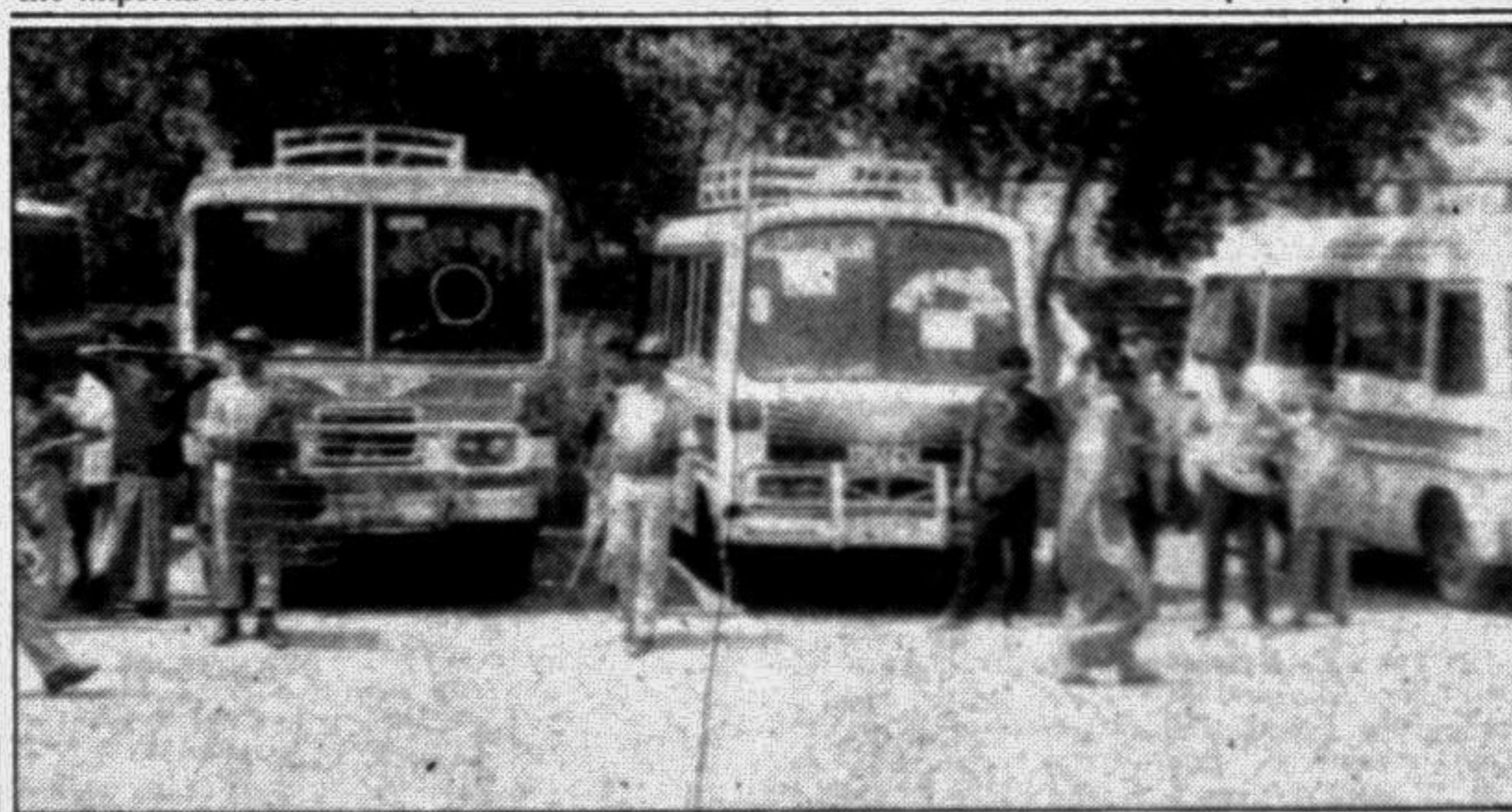
Mini-buses in front of the Secretariat yesterday during the hartal.

The statement issued by its president Amal Sen and general secretary Rashed Khan Menon said the government has no right to use our soldiers to satisfy the interest of the imperial forces.