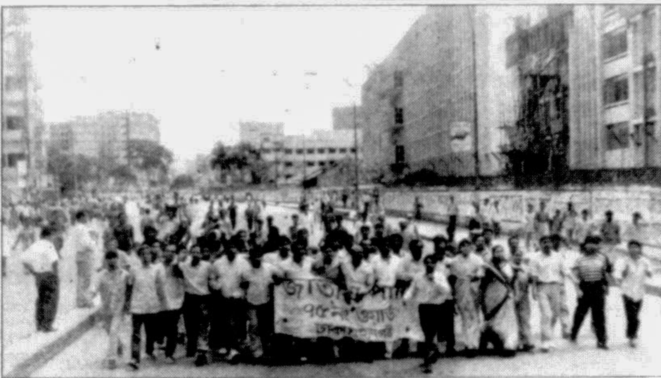
The Jatiya Party brought out a procession during the hartal yesterday in the city.

The conference is aimed at establishing permanent peace in the three districts of Chittagong Hill Tracts.