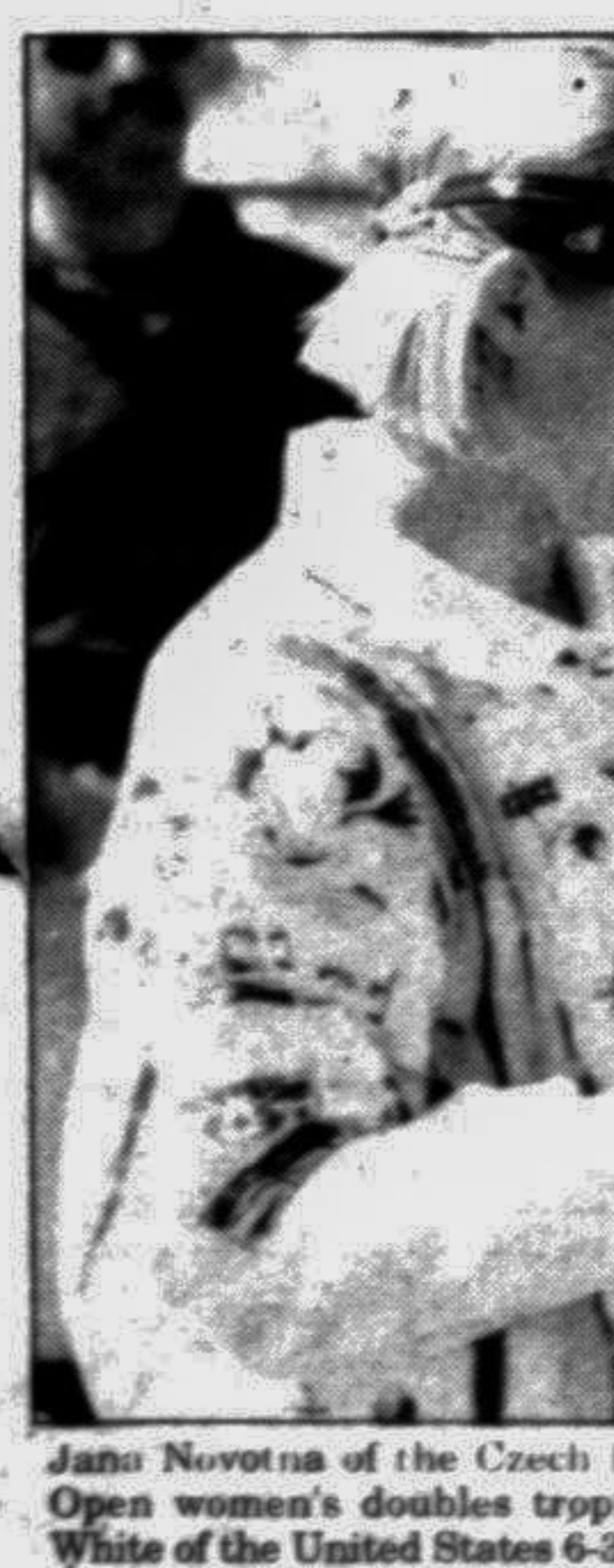
Jana Novotna of the Czech Republic (L) and Arantxa Sanchez-Vicario of Spain hold the US Open women's doubles trophy after defeating Katerina Maleeva of Bulgaria and Robin White of the United States 6-3, 6-3 in the final on Sept 11.