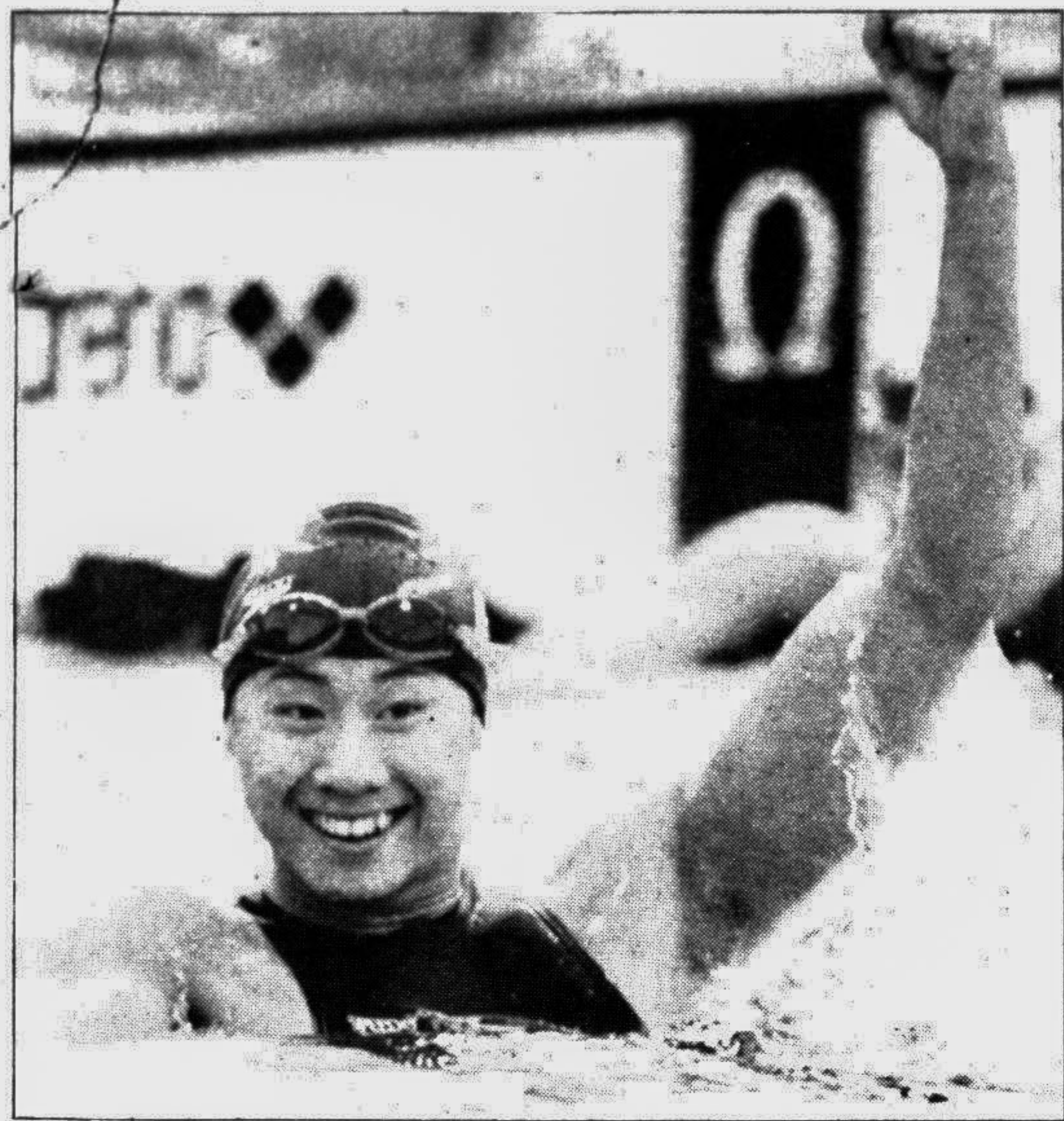
Le Jingyi of China punches the air after winning the women's 50-metre freestyle final in a new world record time of 24.51 seconds at the World Championships in Rome on Sept 11.