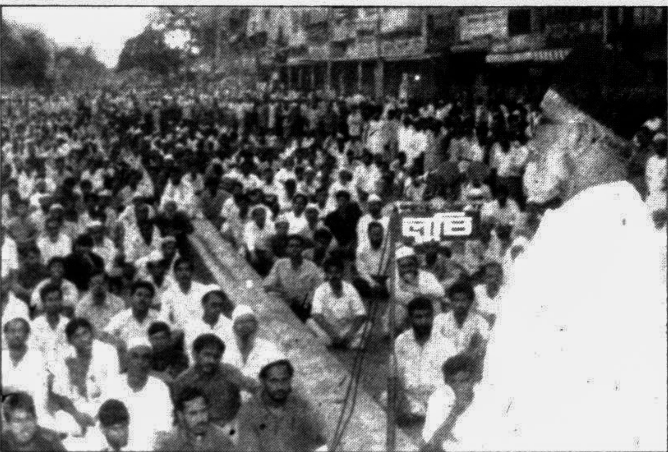
Jamaat-e-Islami Secretary General Matuor Rahman Nizami addressing a meeting at north gate of Baitul Mukarram Mosque in the city yesterday.

RAPPORT BANGLADESH LIMITED management consultants trainers & publishers 98 Malibagh (DIT Road) Dhaka 1217