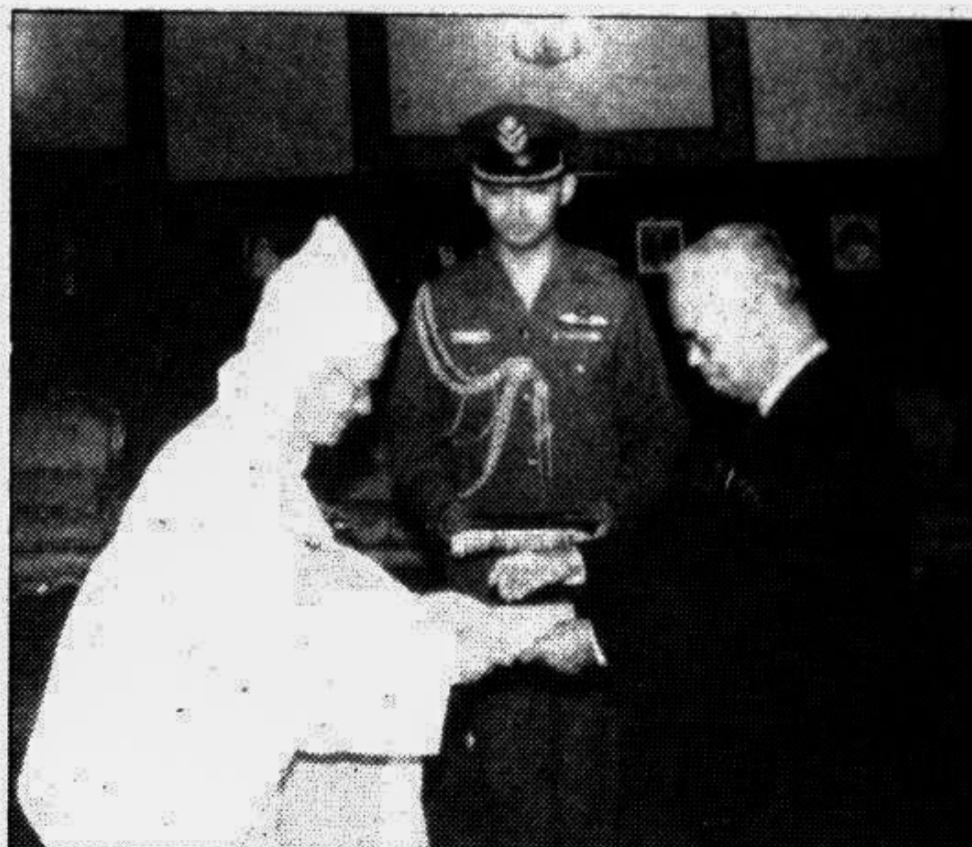
The new ambassador of Morocco to Bangladesh Hassan M Daud presenting his credentials to President Abdur Rahman Biswas at Bangabhaban in the city yesterday.

The first installation ceremony of the Rotaract Club of Shabbagh schedule for today has been postponed due to unavoidable circumstances. The new date will be announced later, says a press release.