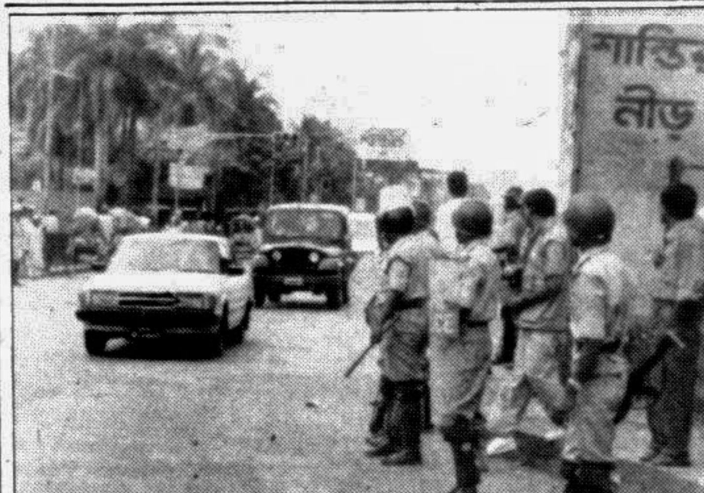
Ministers on their way to work during yesterday's hartal in the city.