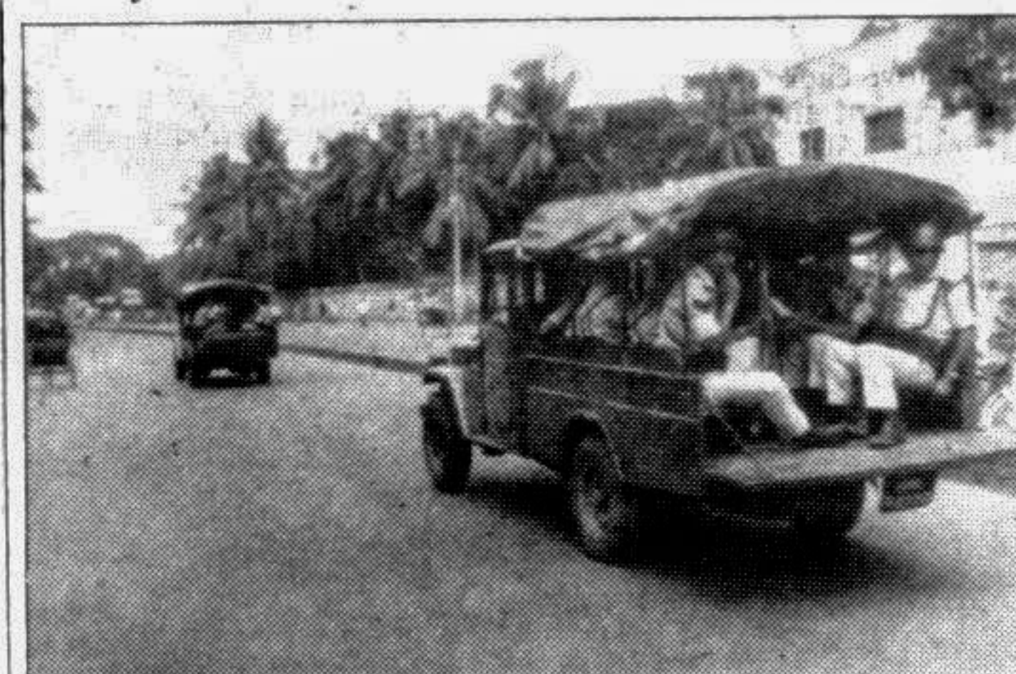
A BDR patrol in front of the Jatiya Press Club during the hartal yesterday in the city.

তিতাস গ্যাস ট্রান্সমিসন এন্ড ডিস্ট্রিবিউশন কোম্পানী লিমিটেড (পেট্রোবাংলার একটি সার্বস্বত্বাধীন কোম্পানী) ফোনঃ ৮৬০৫০০, ৮৬০৫০১, ৮৬০৫০২, ৩২৩৫১৪ পিএবিএক্সঃ ৮১২১৩৫-৪২, ৮১২১৬৭-৬৮