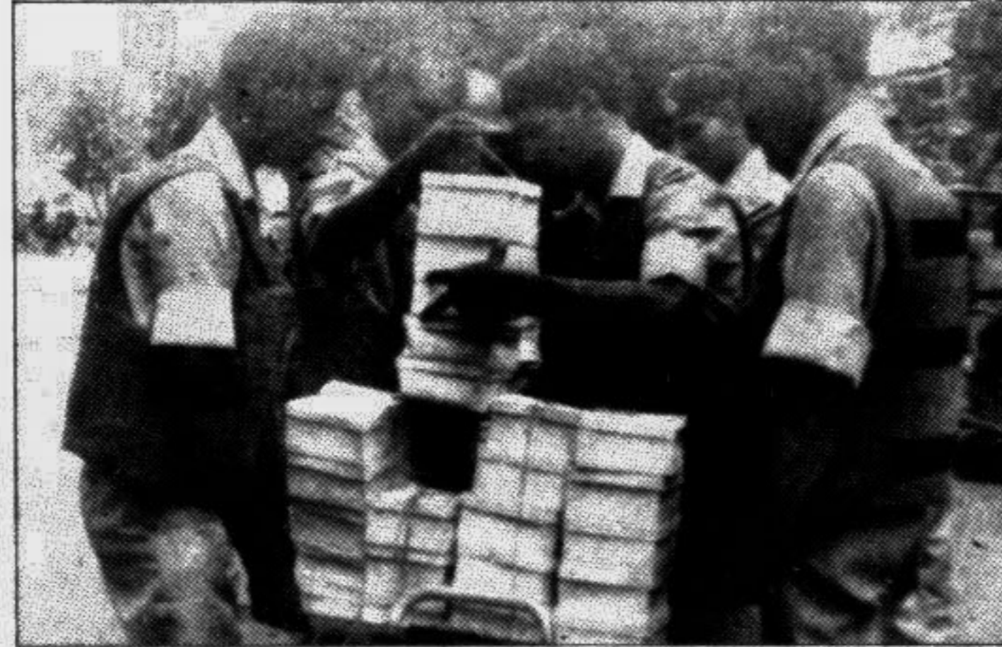
Police being served with special lunch packets during yesterday's 'Dhaka siege'.