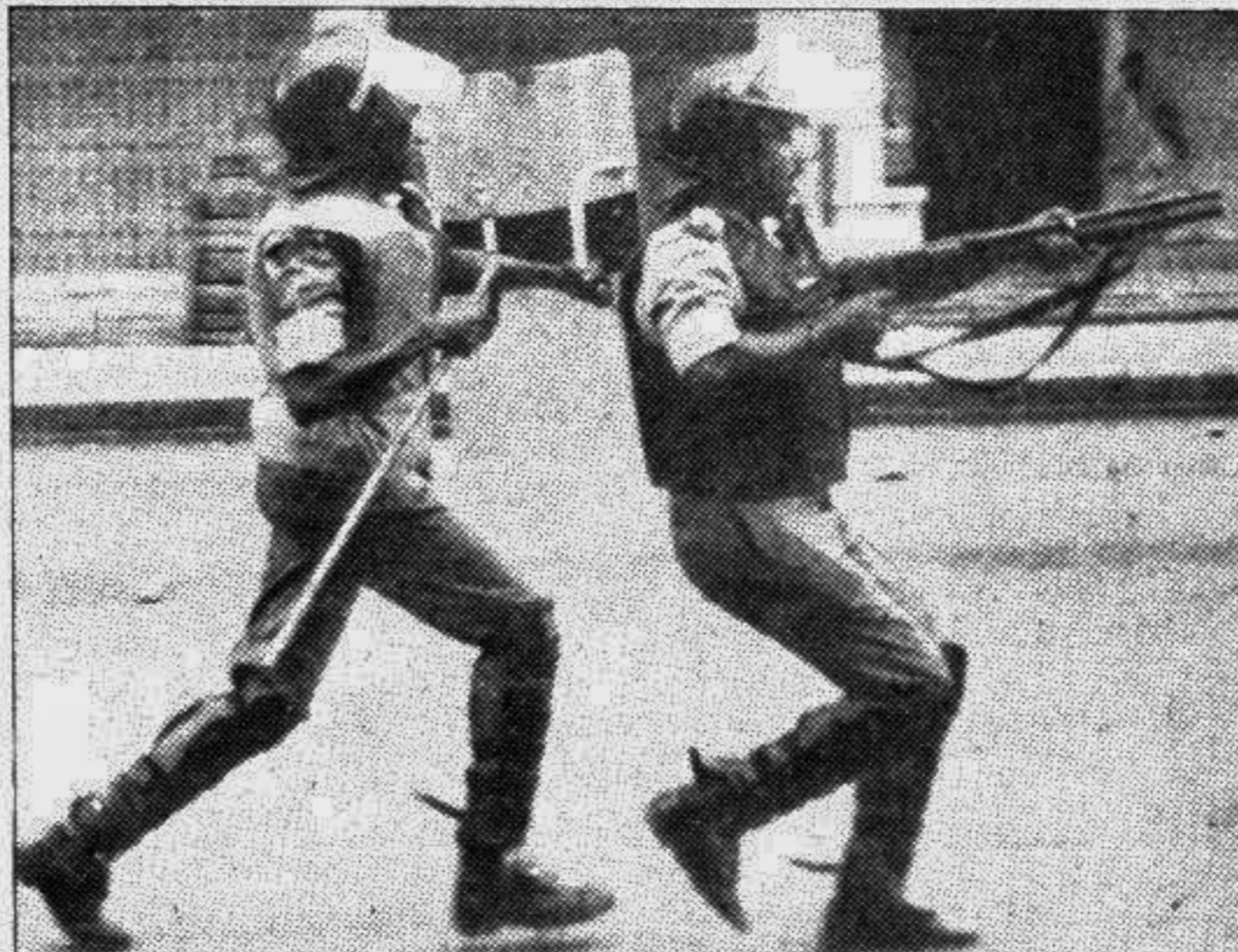
Police firing rubber bullets during yesterday's 'Dhaka siege'.