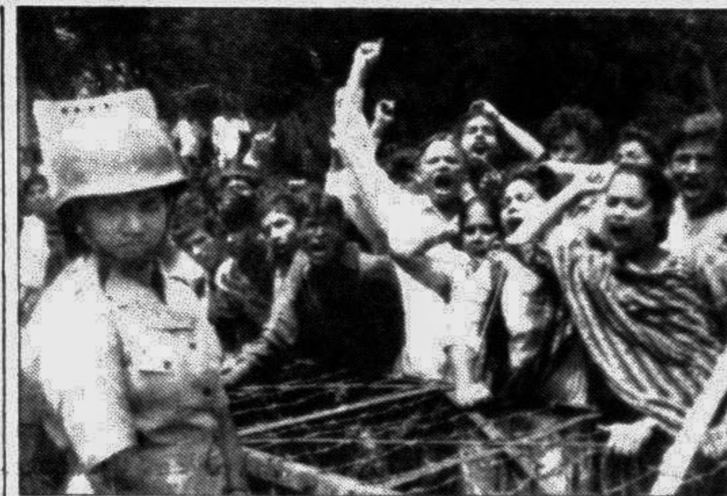
Activists of the Bangladesh Awami League demonstrating near a barricade in front of the Matshya Bhavan in the city yesterday.