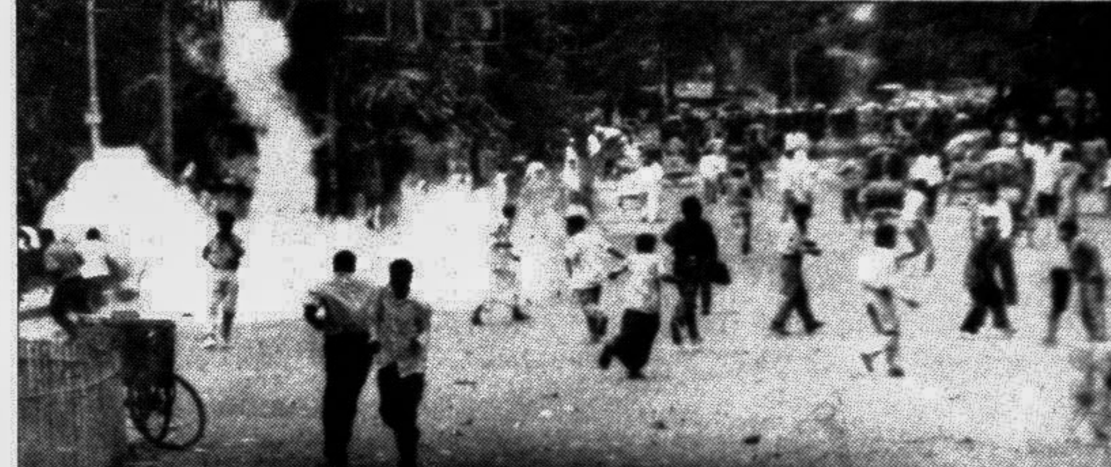
Police lob tear gas shells to disperse the protesters near the Ramna Park in the city yesterday.