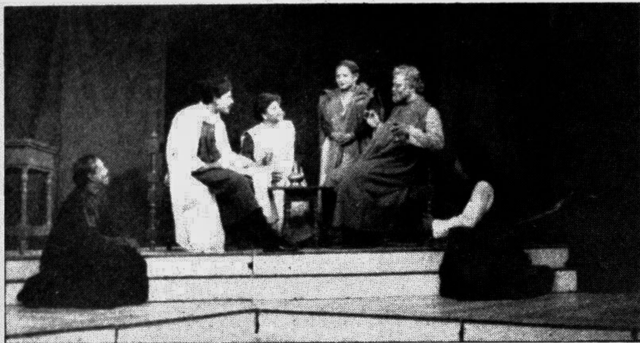
A scene from "Galileo"

Nagorik Theatre Group celebrated the 50th show of "Galileo" recently at the Goethe Institute, before a packed audience. One naturally wonders about its success.