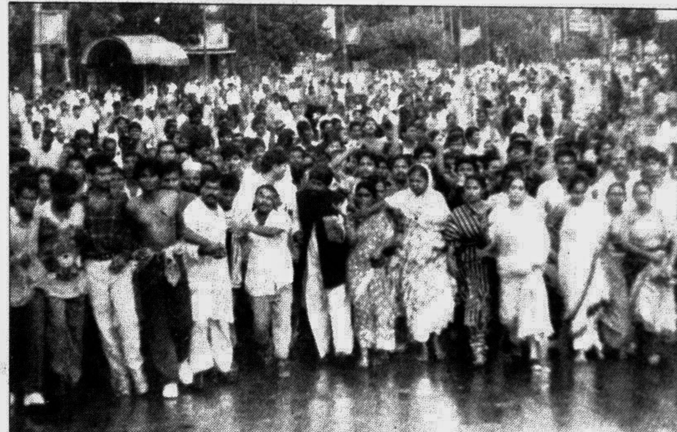
A procession of the Bangladesh Awami League in the city during yesterday's 'Dhaka siege'.