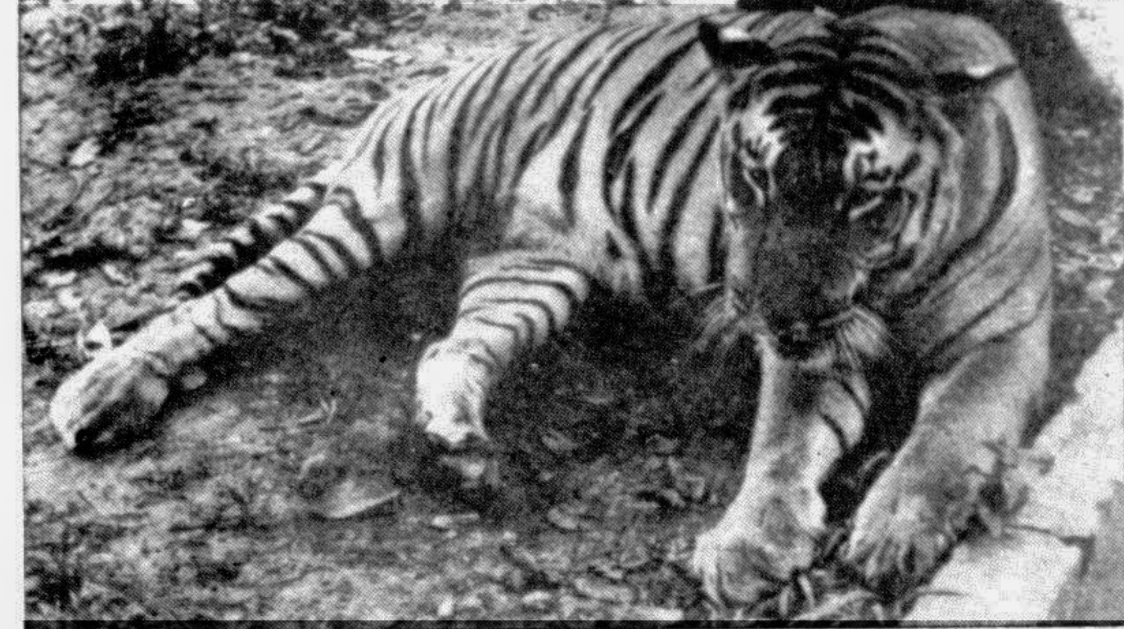
'How far it is from home,' thinks the mighty Royal Bengal Tiger.

Even though it is not possible to create a wilderness as natural as the forest or the places from where these animals originated but we must try to make them comfortable and free as much as possible. Filthy, dirty cages, nasty pungent smell of the waste and rotten food, lakes or water bodies that are green with algae, are not exactly a sight that entertains. Moreover this huge place is literally devoid of fast food shops or icecream parlours. Without, chips, pop corns or icecream cones and cold drinks, a visit to the zoo is not complete. The zoo is not only for the children but adults too it is a place that entertains and enriches the mind.