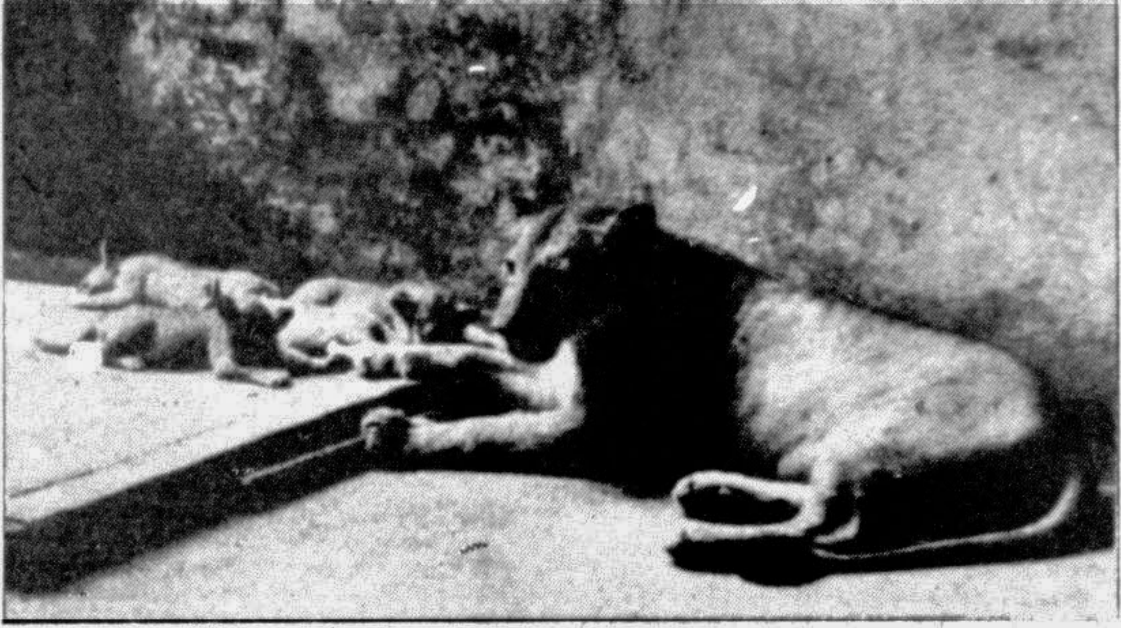
Sleep my baby. A lioness putting her cubs to sleep.