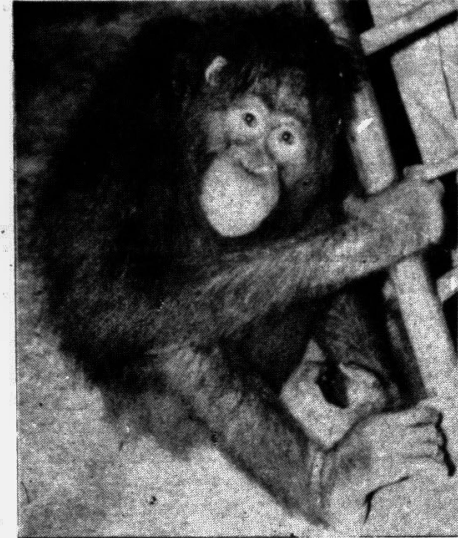
Hey you look familiar.

from each other. But among all the snakes I was amused by the huge pythons, there were two of them, they were so huge that they just could not move, still then, I didn't dare try the Tarzan's act, with real snakes.