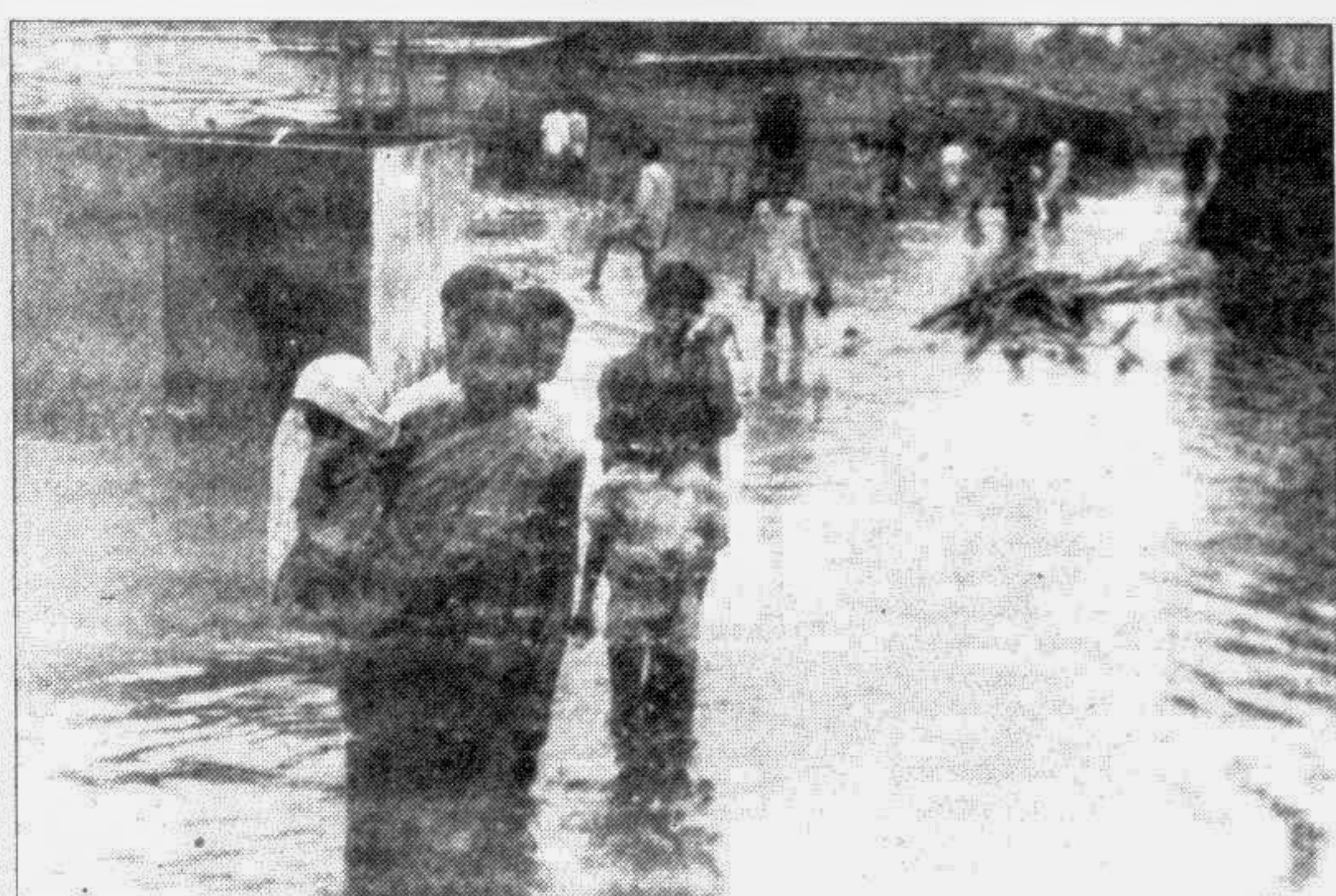
The low lying areas of the city were submerged in yesterday's downpour. This picture was taken from Fakirerpool area.