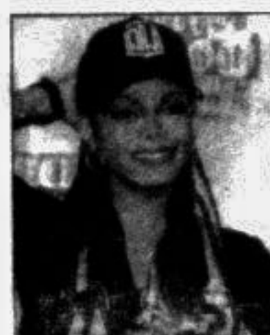
Janet Jackson wins MTV Music Award Page 5