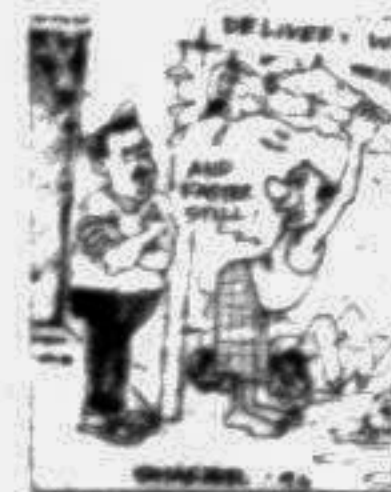
A Clean, Rewarding Job Page 3