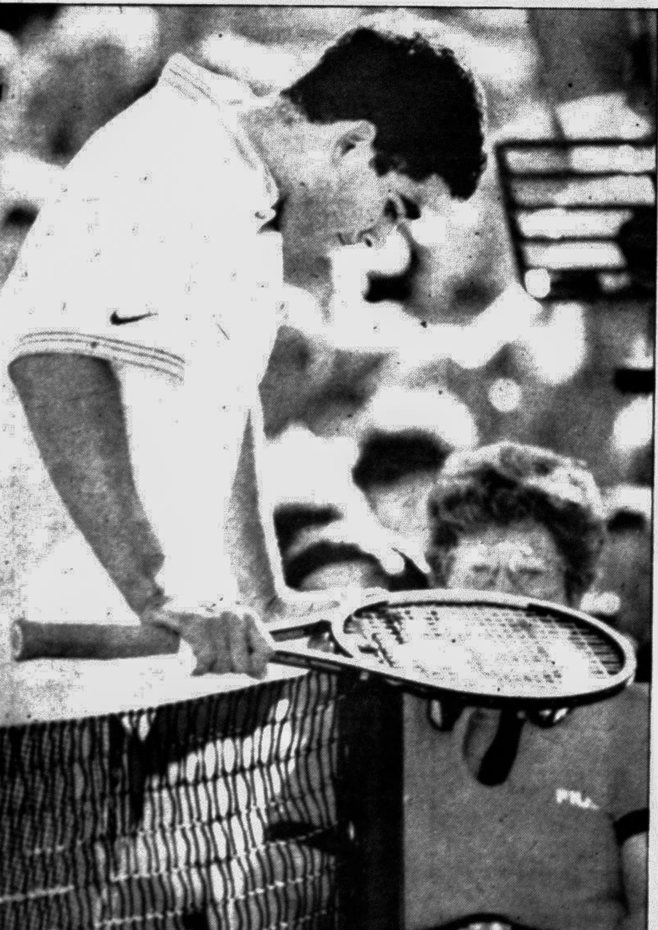
Top-seed Pete Sampras of the United States leans on the net after a point late in his match against unseeded Jaime Yzaga of Peru at the US Open on Sept 6. Sampras, who was reportedly suffering from a stomach ailment, was sent packing after a marathon five-setter that ended 6-3, 3-6, 6-4, 6-7, 5-7.

CRYPTOQUIP B K T S P U G W U G W B B I J - S Z W H U K U E C P I Q W I T H I W T G I K Q K U E C V K Z W G V W K I P U K T V P G Yesterday's Cryptoquip: ONE WILD, PASSIONATE ARTIST TO ANOTHER: LET'S PAINT THE TOWN RED. Today's Cryptoquip clue: V equals H The Cryptoquip is a substitution cipher in which one letter stands for another. If you think that X equals O, it will equal O throughout the puzzle. Single letters, short words and words using an apostrophe give you clues to locating vowels. Solution is by trial and error.