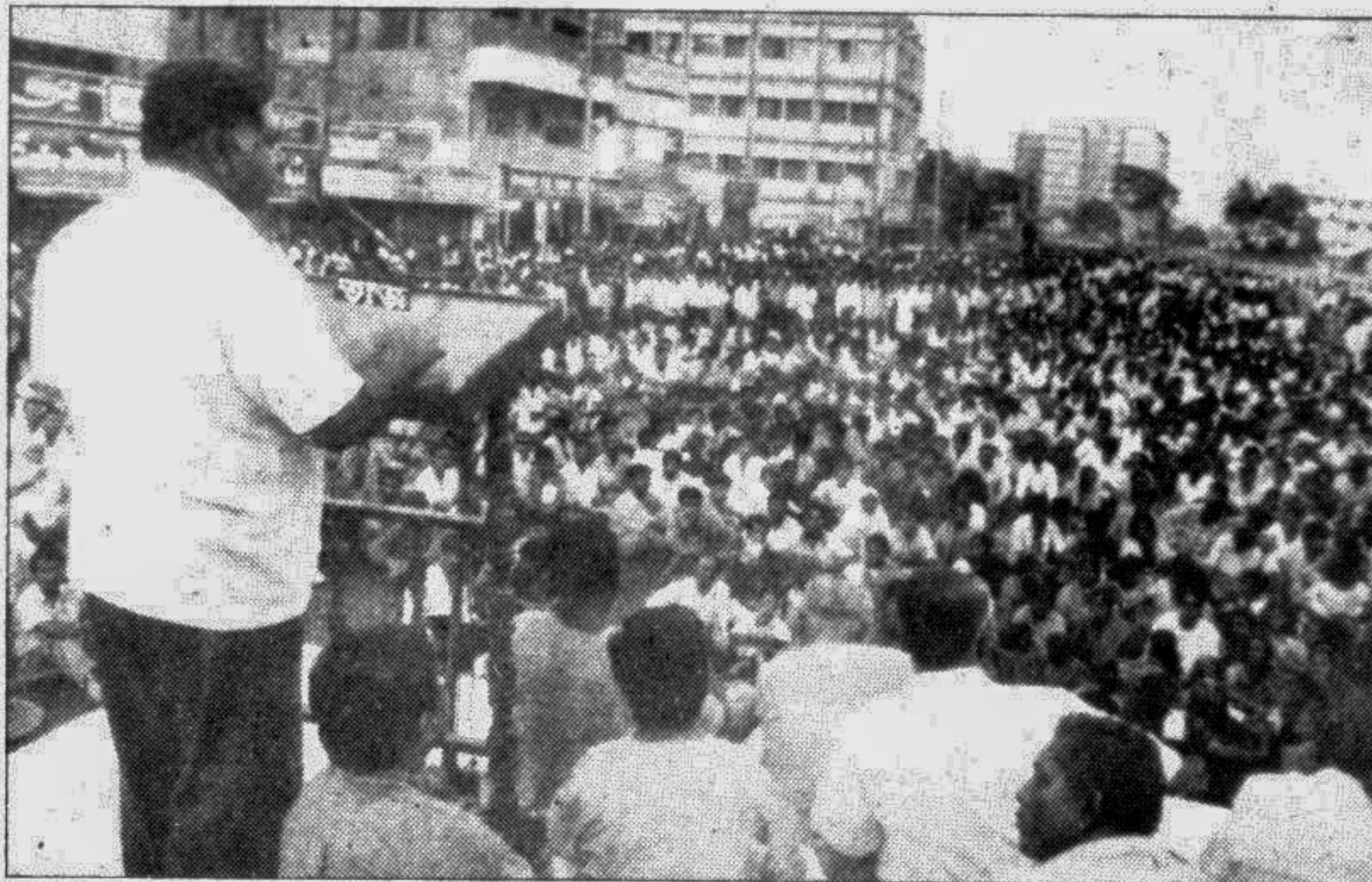
Dr Kamal Hossain, president of the Gano Forum, addressing a Left Democratic Front, an alliance of eight left-leaning parties, rally at Tophkhana Road in the city yesterday. The rally was organised to create mass awareness against communalism, fundamentalism and fatwabaz.