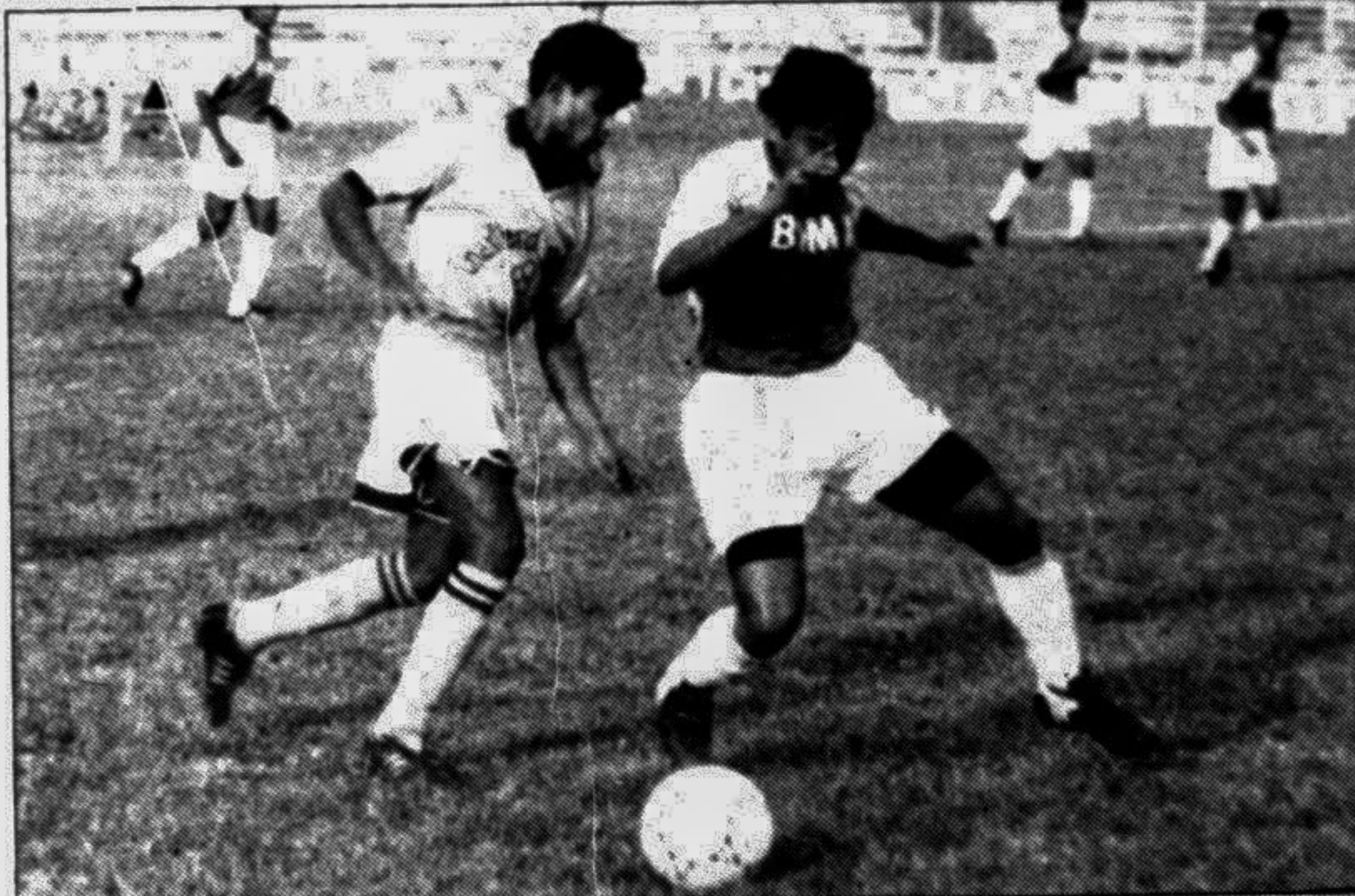
Action from the Star First Division encounter between Sadharan Bima and Dhanmondi Club at the Dhaka Stadium yesterday. The game ended in a goalless draw.