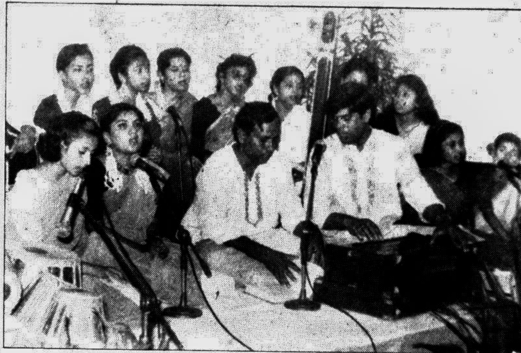
Artistes of Surobani, rendering songs at a musical evening organised by the group at the Vishwa Sahitya Kendra yesterday.