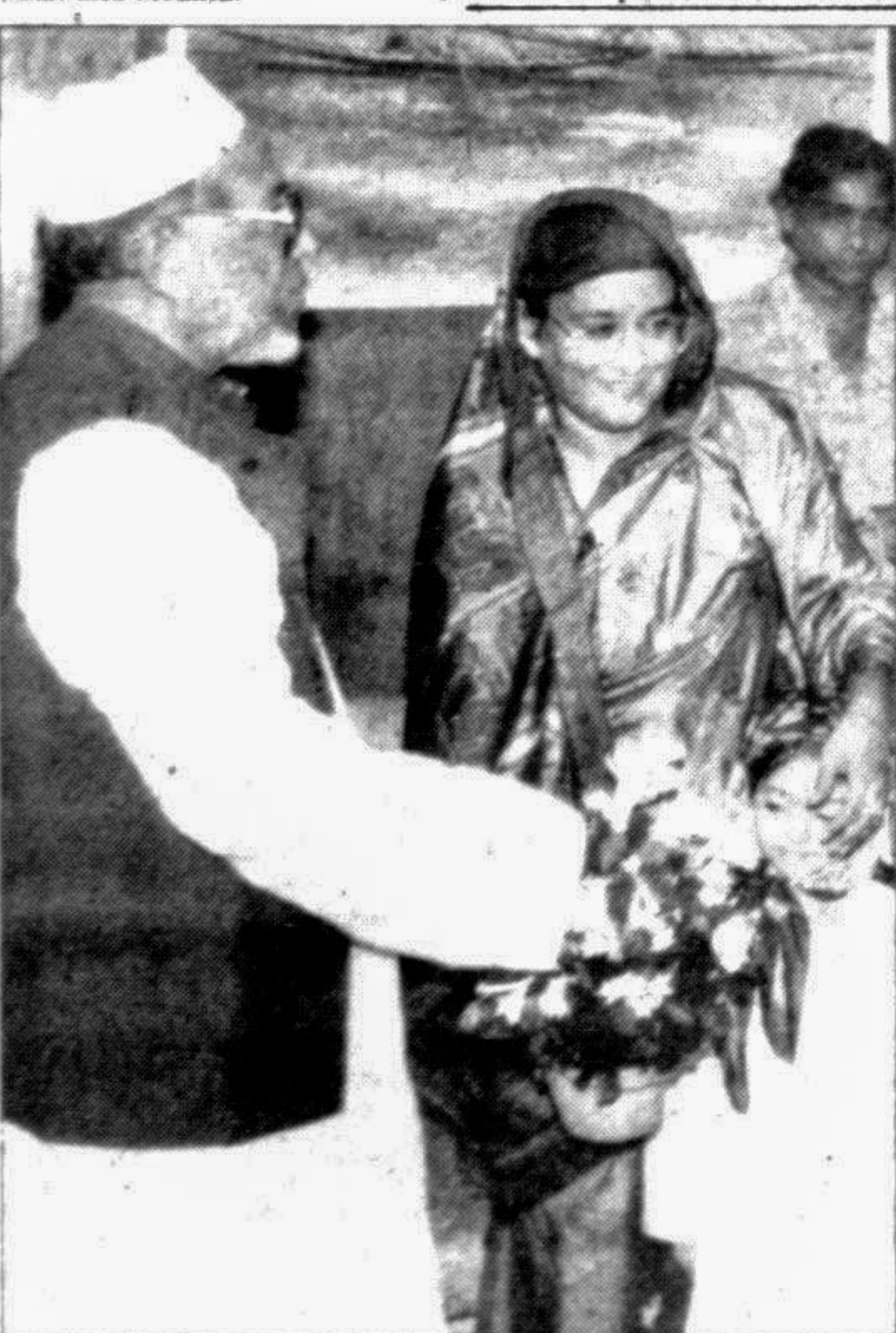
Abdus Samad Azad seen receiving Awami League chief and Leader of the Opposition in Parliament Sheikh Hasina at the Zia airport yesterday on her return after performing Umrah in Saudi Arabia.

During her visit, Hasina also attended a number of functions organised by the Bangabandhu Parishad, the Bangabandhu Smriti Sangsad and the Friends Society of Dahrar, Jeddah and Medina.