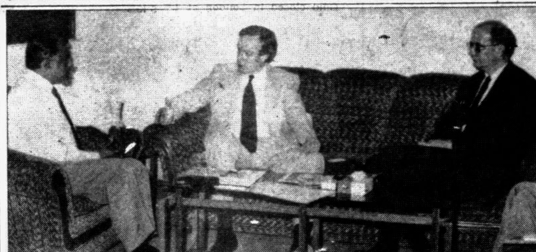
High Commissioner of United Kingdom to Bangladesh Peter Fowler and Deputy High Commissioner called on Redwan Ahmed MP, President of the Bangladesh Garment Manufacturers and Exporters Association of Bangladesh, at latter's office recently. They discussed the possibilities of increased foreign investment in Bangladesh and prospects of more bilateral trade between the two countries.

The JMBA in cooperation with BUET had organised and successfully completed another training programme for the officials of its Environment Unit from July 23 to August 11, 1994.