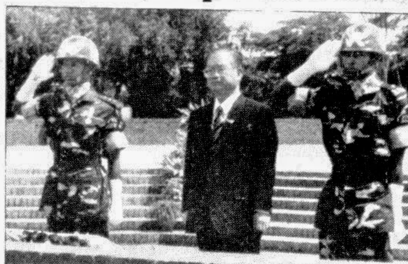
The visiting South Korean Prime Minister Lee Yung Dug paying homage to the martyrs of the War of Liberation by placing wreath at national memorial at Savar yesterday.

As usual people are making the minimum investment, minimum labour, while taking the maximum profit. Isn't there a single John Wayne in this country who will pack his six shooter and stand up against this callous indifference to human life. Life isn't cheap. It's about time people realised this.