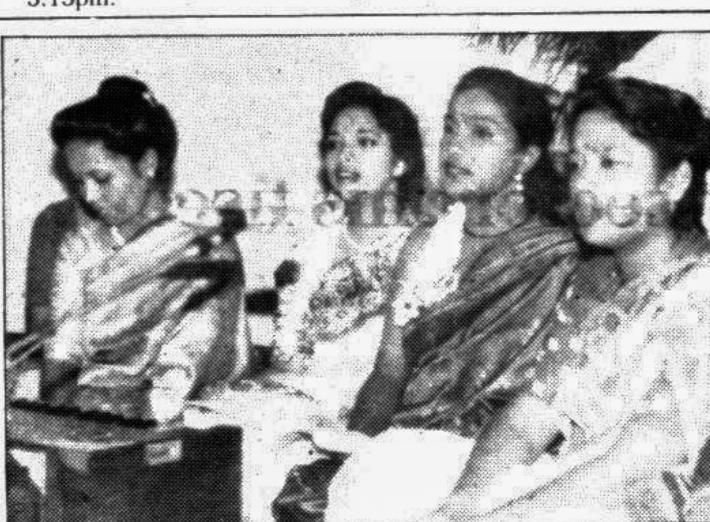
Singers rendering songs at a cultural evening organized by the BCS (administration) Association in the city yesterday.

Lions Club of Dhaka Lalbag: The regular club and board meeting will be held. Venue: Hotel Purbani. Time: 5:15pm.