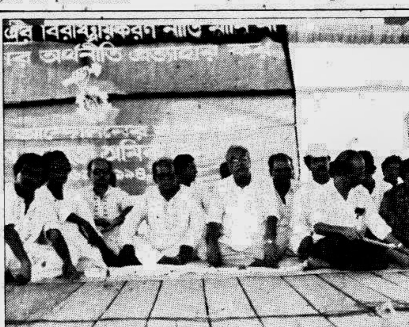
Leaders of the SKOP and the Bangladesh Songkut Sramik Federation are seen at a function organised on the occasion of the 25th founding anniversary of the federation at Adamjeenagar Saturday.

Besides, members of the 30 organisations, students of various educational institutions, members of Boys Scouts, Girls Guides, Rover Scouts, eminent educationists and cultural personalities have been invited to join the procession.