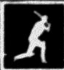
KANDY, Sri Lanka, Aug 28: Pacerman Waqar Younis recorded his fourth haul of 10 or more wickets in a Test as Pakistan overwhelmed Sri Lanka inside three days in the third and final Test on Sunday, reports Reuters.