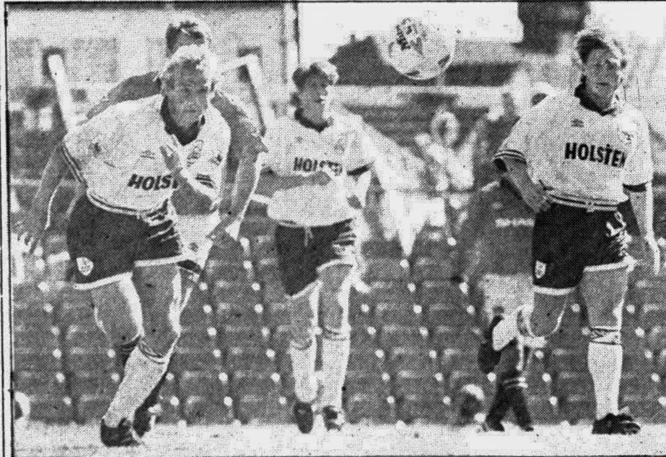
Tottenham's German World Cup star Juergen Klinsmann (L) races after the ball as teammate Teddy Sheringham (R) watches during English Premier league football match against holders Manchester United. United won 1-0.

United manager Alex Ferguson said: "Schmeichel made three marvellous one-on-one saves as well as the penalty."