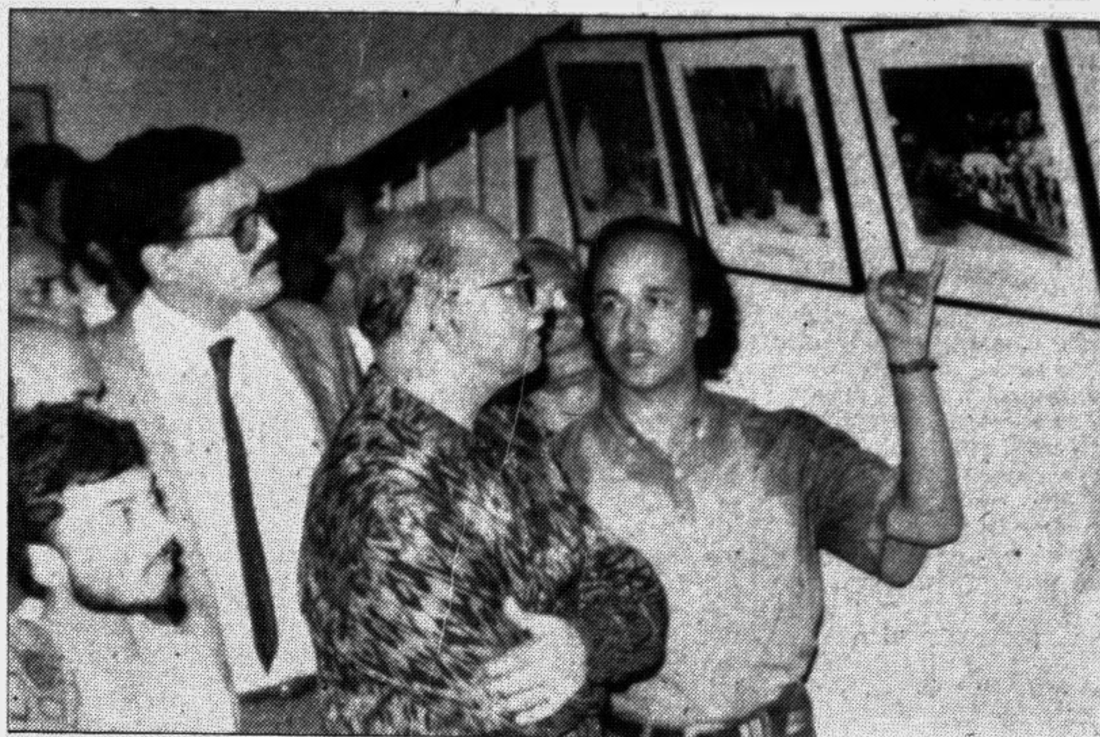
Foreign Minister A S M Mostafizur Rahman looking at a photograph at an exhibition which began at the Shilpakala Academy gallery in the city yesterday.

Biman Bangladesh Airlines, Bangladesh Fire Service and Civil Defence, Airlines Operator Committee, Bangladesh Air Force, Army, Navy, JWTA, Health Directorate, Police and all other agencies located at the airport will take part in the final exercise.