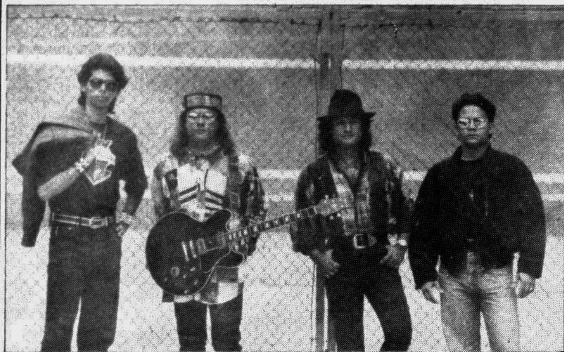
The four-member band

They dress like mid 80's hard rockers donning cowboy boots and mandatory leather, but their music is surprisingly sensitive with catchy pop overtones. Meet Miles — Bangladesh's pre-eminent rock band. The group performed their first Pepsi-backed indoor concert at the Engineer's Auditorium in Dhaka on August 23.