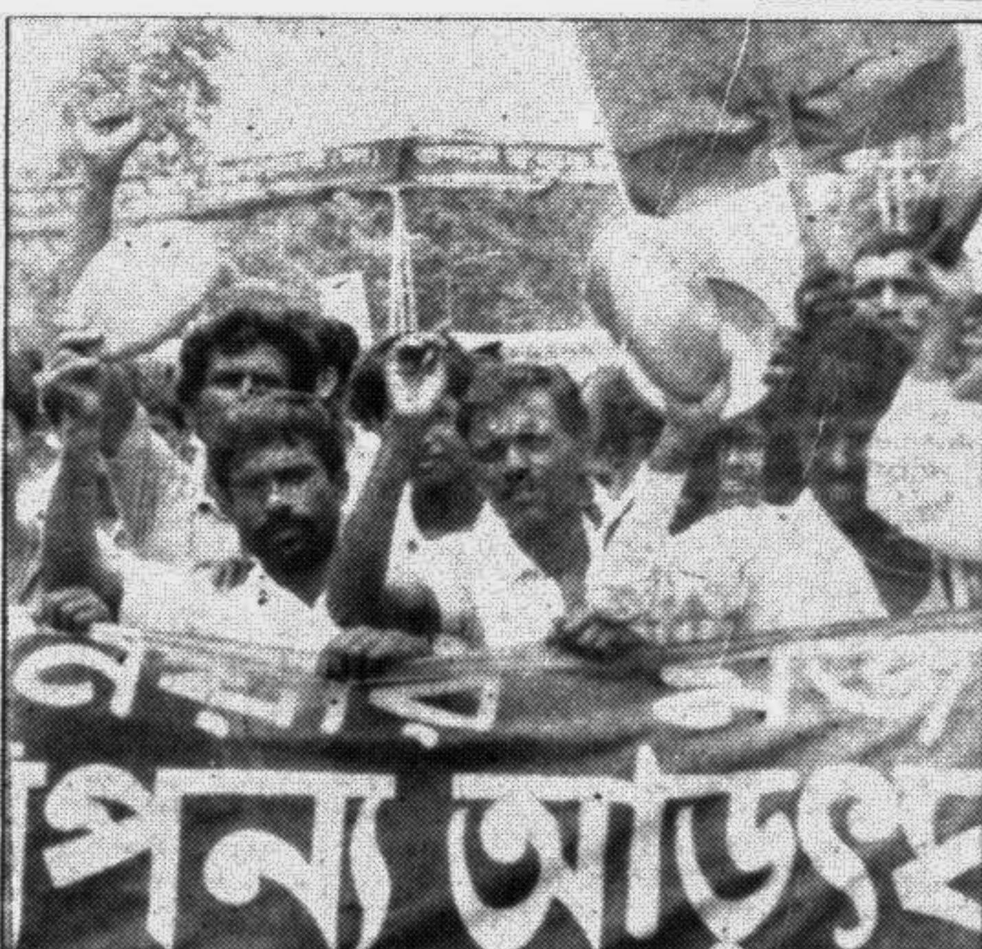
Employees of the wholesale depot for agricultural produce brought out procession in the city's Shyam Bazar area yesterday to press for their 8-point demands.